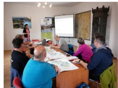
Public meeting in Popelín

The first meeting took place in Popelín on 20 May 2019. It was meeting with the lowest number of participants during which it became clear that the participants had already dealt with the