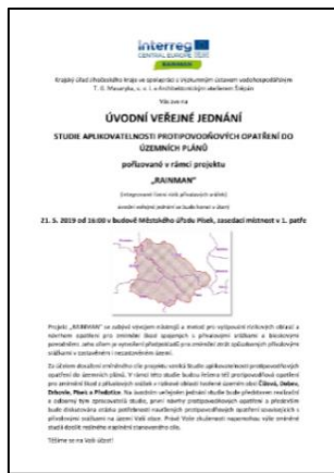
Invitation to public meetings

Due to its professional focus on spatial planning, the Region of South Bohemia has set up a study on how to implement flood protection (risk reduction measures) in spatial planning documents, taking into account all legal requirements and limits regulations of the Czech Republic. The study “Study of applicability of risk reduction measures in spatial plans” was conducted in close cooperation with the external contractor Architectural studio Štěpán.