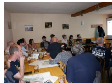
Public meeting in Milejovice

The fourth meeting took place in Milejovice (the pilot site Strakonice) on 23 May 2019. It was the meeting with the highest number of participants. The participants were very active and reported on their experiences in implementing risk reduction measures against heavy rain events (for example a dike was built in recent years, see picture). During this meeting, funding policy and the issue of raising public awareness were discussed.