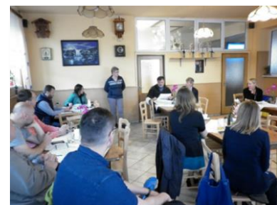
Public meeting in Lipí

The third meeting took place in Lipí on 22 May 2019. This pilot site is of special importance in the spatial planning study, as only in this location will a specific modification of a spatial plan be simulated, including an official negotiation process with the public as required by law in the Czech republic. In view of this specificity, many concerns were expressed during the meeting regarding negotiation with the public (especially with the owners) and the promotion of changes in this pilot site. In addition, similar to the meeting in Písek, many questions were raised about the binding nature and possible use of the study.