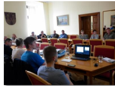
Public meeting in Písek

The second meeting took place in Písek on 21 May 2019. The participating communities were very active and pleased that the project focused on the whole small basin and not only on the area of one municipality, so that the discussion about heavy rain induced risks can be conducted in a reasonable way. During this meeting, many questions were raised about the binding nature and possible use of the study. When comparing the risk reduction measures proposed by VUV with the local spatial plans, it was found that, for example, the proposed soil protection measures are in conflict with a traffic bypass.