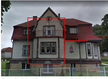
e of building: Kindergarten in the P er / investor: Municipality of Lubawka