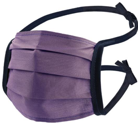
Fig.1: The flat-fold mask shape (4)

The mask shape may include flat-fold or duckbill. Theshall be designed to fit closely over the nose, cheeks and chin. When the masks does not fit well to the wearers face because of the size and shape of the mask, an internal / external air penetrates through the esges of the mask and is not filtered through the fabric. (1)