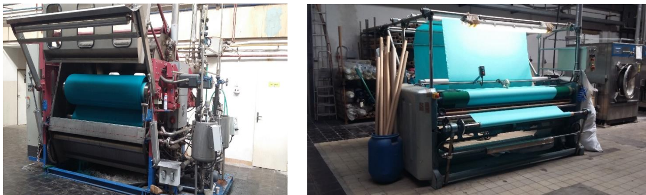
Fig. 5: Dyeing and measuring of the fabric with photocatalytic phtalocyanine dyestuffs

Testing of photoactivity of the finished textiles was conducted by Centre for Organic Chemistry by means of an iodide method. (8, 9, 10)