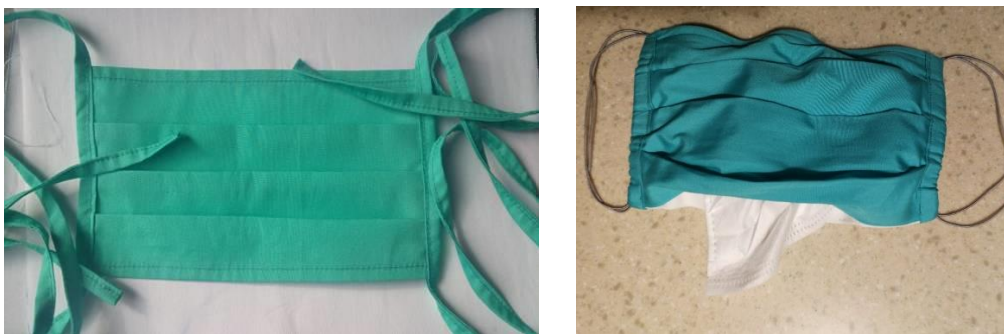
Fig.6 : “FreshDye” face mask

For manufacturing of the “FreshDye” face masks were used both kinds of the dyed fabrics - cotton and blend of cotton with PES: 100% cotton (120 g/m 2 ) or blend cotton/PES 50/50 (140 g/m 2 ). The amount of 1.000 running meters of the fabric dyed with phtalocyanine dyestuff is sufficient for manufacturing of 40.000 pcs of face masks (fabric width 160 cm) or 50.000 pcs (fabric width 180 cm). The face mask is made from two layers of textile; the outer layer is made from photocatalytic “FresDye” fabric, the inner is made from common textile (use of the photocatalytic textile for inner layer does not make sense because it is not enlightened with light). Also the type of the mask with “pocket” for inserting replaceable filter material was made.