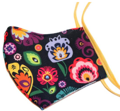
Fig.2: The duckbill mask shape (5)