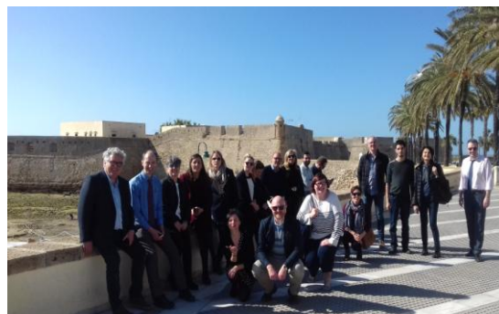
Members of the MMIAH Steering committee at the 6th Project Meeting in Cadiz, February 2019.