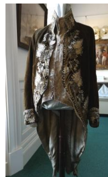
Joseph Bonaparte's Coat

As work on our Atlantic Area project progresses, partners begin to find more and connections between our regions. One such recent discovery – a piece of clothing, housed at the Limerick Civic Trust,