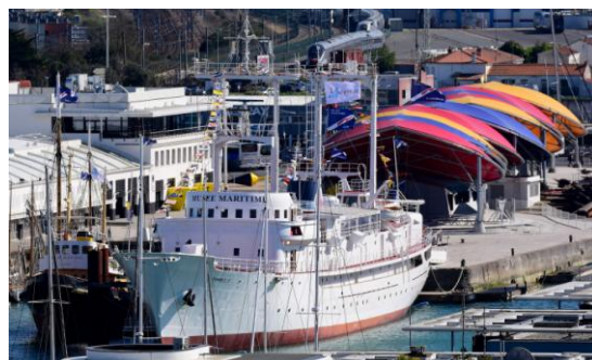
The France I afloat in the Trawler's Basin, La Rochelle.