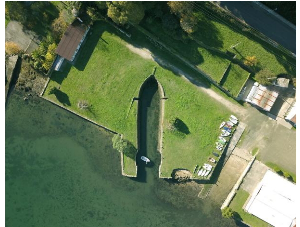
The Tide Dam at A Cabana; Restoration Project 2017 – 2019. Total project value: €217,390. Images courtesy of STGO Estudio de Arquitectura+Multimedia