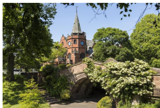
The picturesque Dell Bridge, Port Sunlight, Liverpool.