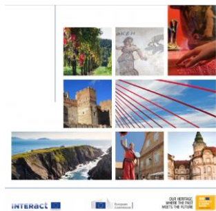
MMIAH Project Stand at INTERACT event in Vienna, Dec 2018 & front cover image of INTERACT e-book in which MMIAH features.