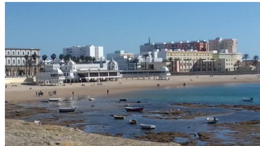
View of the seafront and early 20th century Spa in Cadiz; taken during 6th Steering committee Meeting in Feb. 2019.

The 7th MMIAH Steering Group Meeting to coincide with the 75 th anniversary of the D-Day Landings will take place in Caen-Normandie in June 2019.