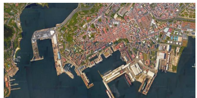
Aerial image showing location (denoted by white oval) of the A Cabana Tide Dam in relation to urban Ferrol. Image courtesy of STGO Estudio de Arquitectura+Multimedia

The tidal pier of A Cabana is being restored through a project presented by the Municipality of Ferrol in the 2017 call for projects under local participatory development strategies approved by the local action groups of the fishing sector for the sustainable development of fishing areas. Marco FEMP.