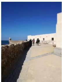
At the fortification of Santa Catalina, Cadiz, during 6 th SC Meeting, Feb 2019.