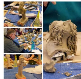
Above: Images of the Arts & Minds Project in action - Plymouth