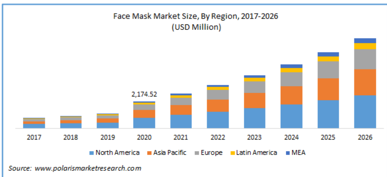
Fig. 1 : Face Masks Market Size in period 2017-2026 (6)

Now, there is the sudden increase due to the COVID-19 pandemic. The face masks are used by people worldwide as a physical barrier, to prevent the spread of the virus from the wearer. Some countries require the mandatory use of the face masks in public places. According to WHO, the reuse of the masks is not recommended and the masks should to be replaced. During the COVID-19 pandemic, the face masks are worldwide widely adopted in hospital and health care sectors, industry, supermarkets, stores, public transport or government departments. Due to this, the face masks market has unprecedentedly grown during past few months and the further growth is expected for the period 2020-2026, as demonstrated in the Fig.1. (6)