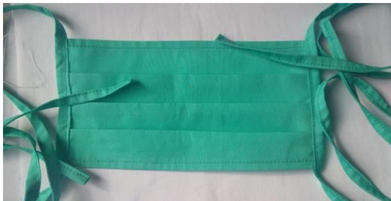
Fig. 3 : “FreshDye” face mask