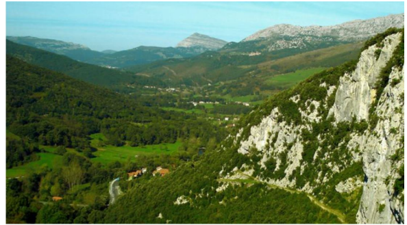
Sustainable Municipalities Community of Cantabria (Aspiring Geopark) | Spain |