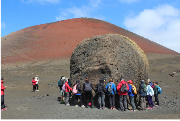
Lanzarote and Chinijo Islands UNESCO Global Geopark | Spain |