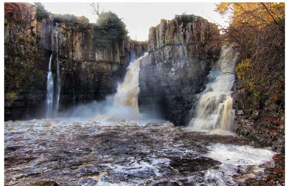
North Pennines AONB UNESCO Global Geopark | United Kingdom |