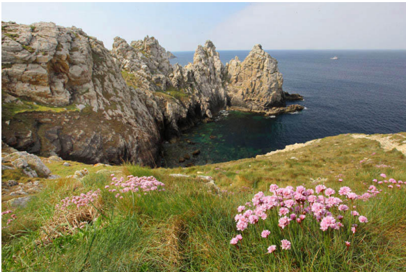
Armorique Regional Natural Park (Aspiring Geopark) | France |