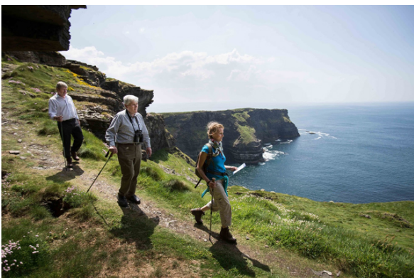
Burren and Cliffs of Moher UNESCO Global Geopark | Ireland |