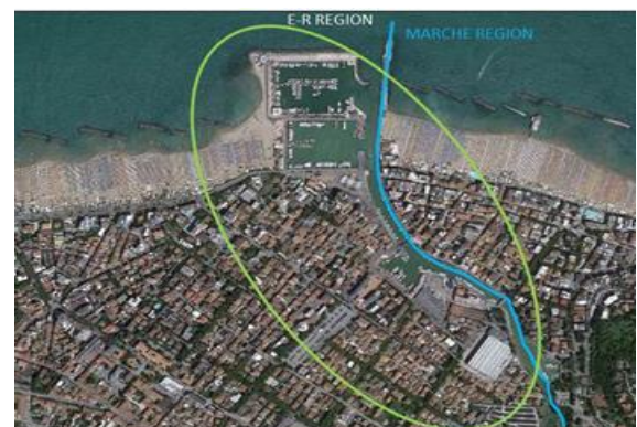
Fig 1. Cattolica pilot area

which, in addition to endangering activities related to fishing and local shipping, has led to a decrease the attractiveness of the harbour and of the seaside area to tourists, difficulties and crisis in human activities reflecting on the local economy and employment.