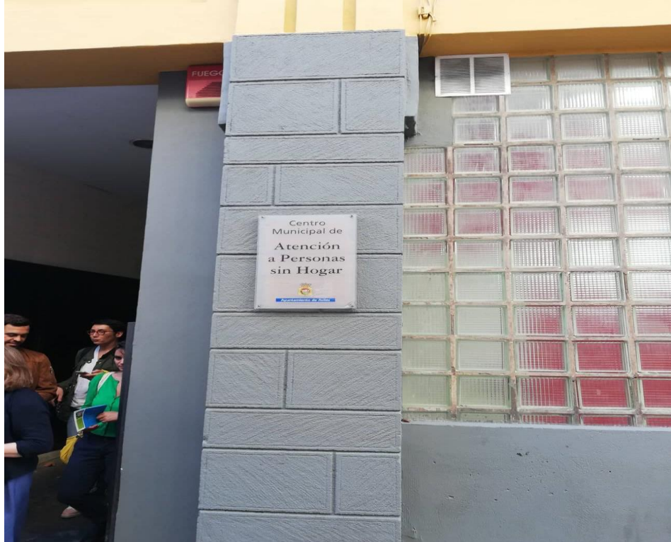
Figure 1 - Entrance of the Avilés Homeless Shelter