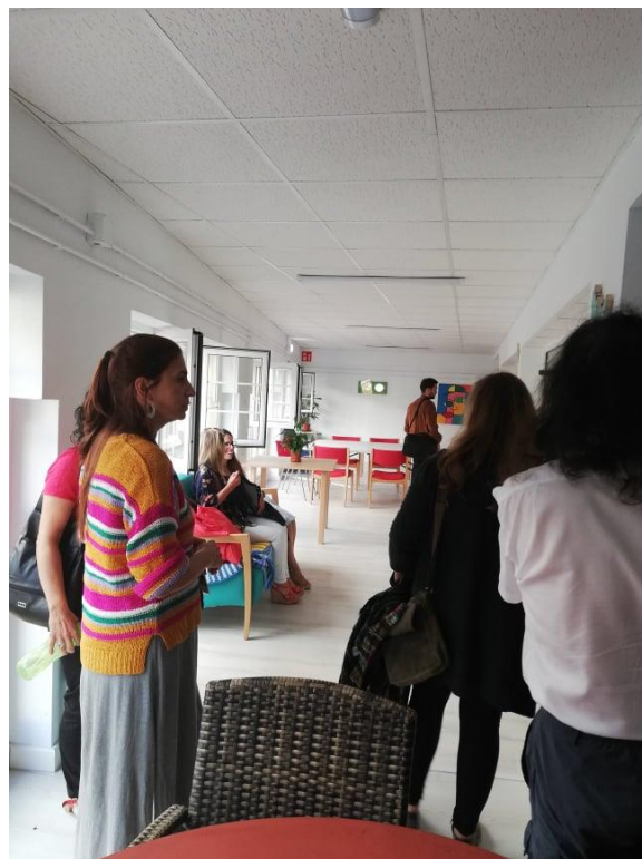
Figure 4 - Shelter employee explaining how the Centre works