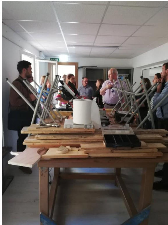
Figure 3 - Handwork Workshop Facilities