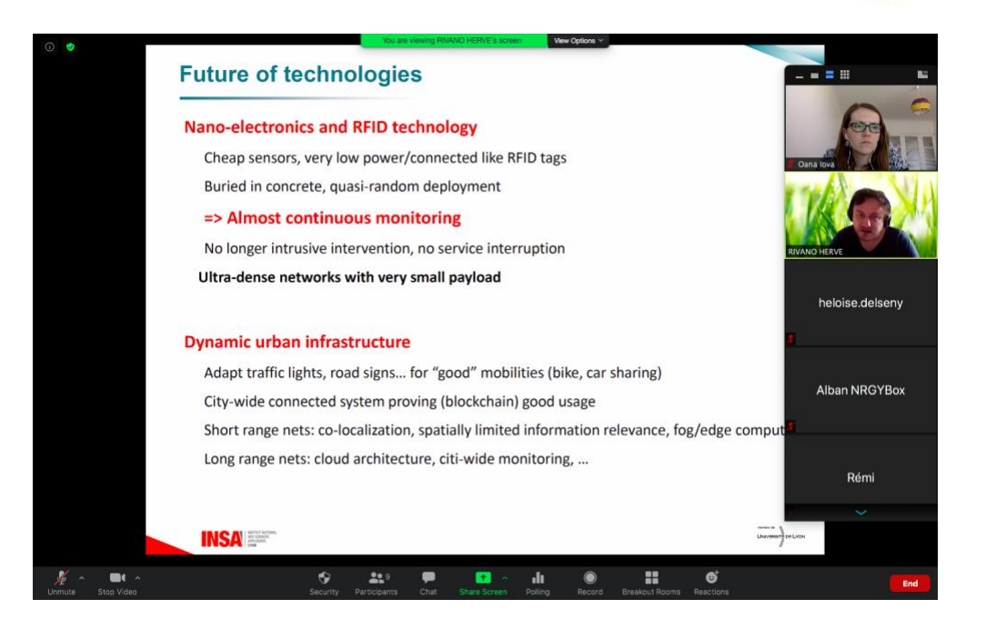
Figure 1 Presentation on Smart Cities by Herve Rivano