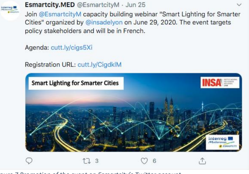
Figure 7 Promotion of the event on Esmartcity's Twitter account