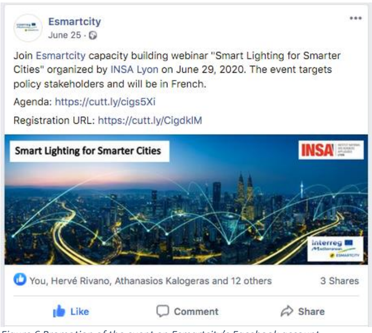
Figure 6 Promotion of the event on Esmartcity's Facebook account

Figure 5 Promotion of the event on the Esmartcity website