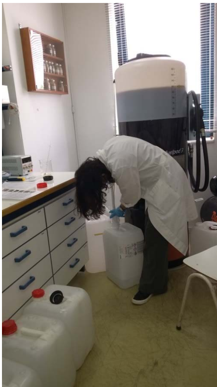
Adding catalyst & methanol to UCO in the machine to produce biodiesel