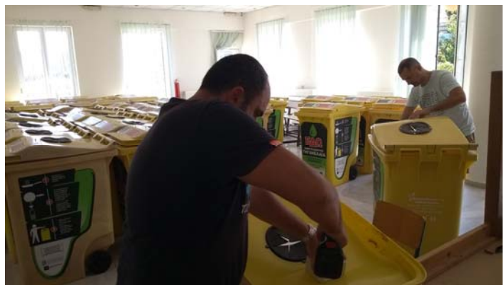
Preparation of UCO bins to be distributed in Rethymno Municipality