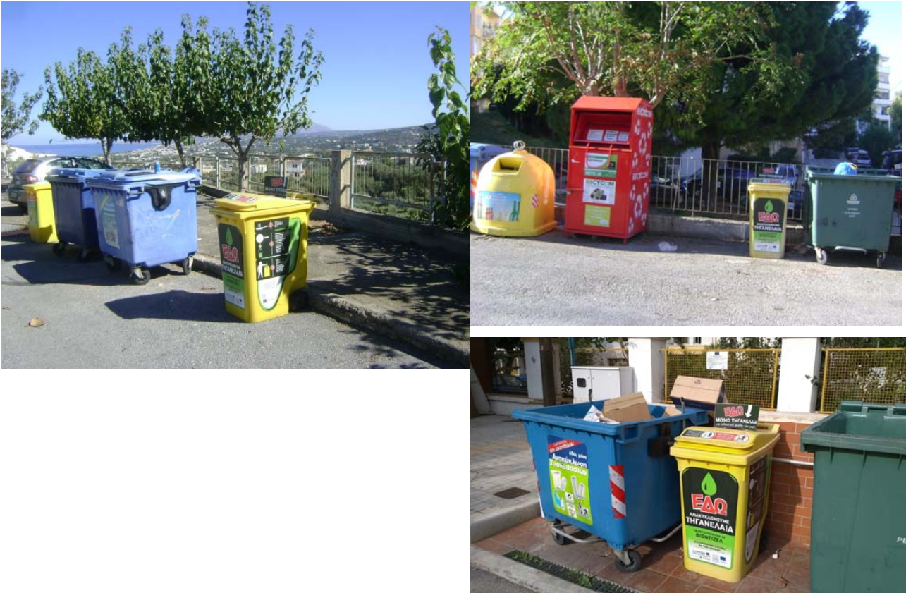
Indicative photo of a UCO bin located at Rethymno Municipality

Data recorded by the sensors are transferred wirelessly through GSM, in real time and monitored through the software application. Based on the data collected, the platform shows the fill level of UCO bins and provides the optimum routes for the UCO collector, while the system is capable to send alerts to the administrators in case of leaks detection, temperature rise, battery level of the sensor unauthorised movements or damage.