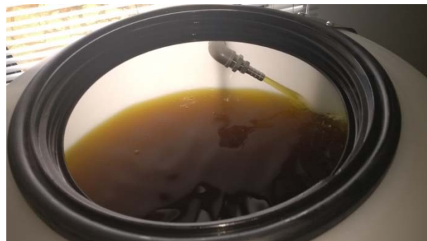
Produced biodiesel in the small scale unit