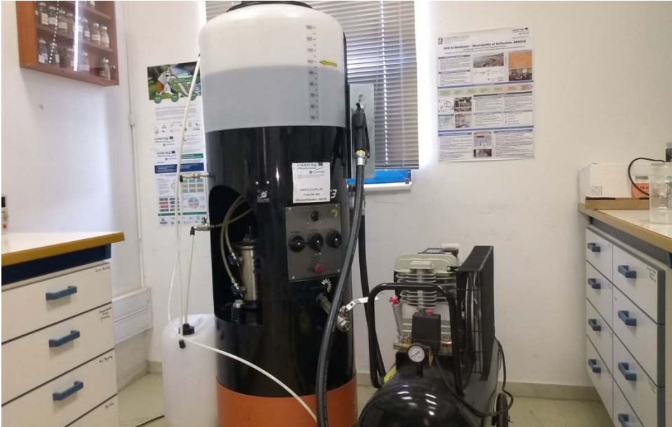
Small scale unit producing biodiesel from Used Cooking Oils

The small-scale autonomous production unit demonstrates the local transformation of local collected UCO to biodiesel.