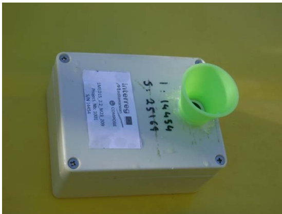
Smart Sensor on the lid of a UCO bin

For the pilot case 3.12 “From UCO to biodiesel”, the UCO collection bins were equipped with smart sensors installed under the bins lids to measure the fill level in regular time intervals, to continuously monitor the position of the bin and instantly detect any significant changes in temperature or unauthorized movements.