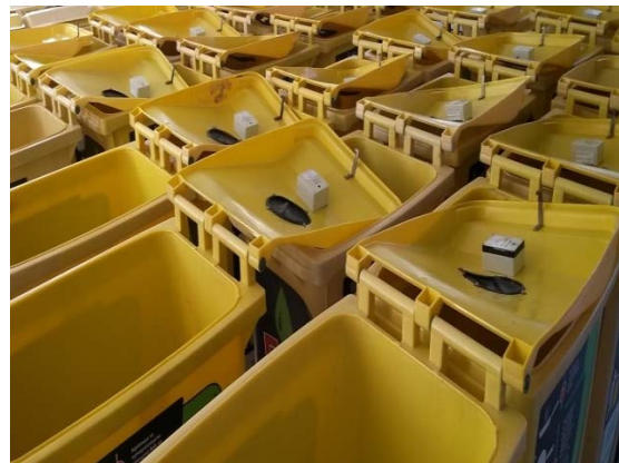
Smart Sensors installation on UCO bins