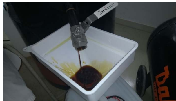
Removing glycerin from the produced biodiesel