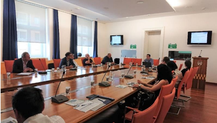
Working on the FQP in Maribor, on 20 September 2018