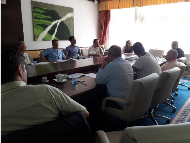
Deliberations on FQP in Rijeka, 25 May 2018