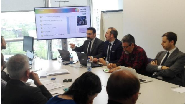
Work in progress at FQP meeting in Bologna, 17 April 2018