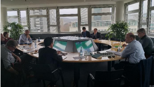
The Stuttgart FQP on 14 March 2019