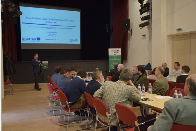
Working at the FQP in Budapest on 27 February 2018