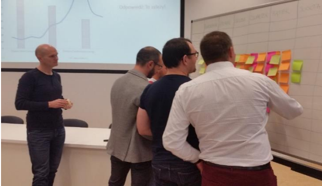
Work during the FQP meeting in Poznan on 16 November 2017