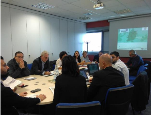
Working on the FQP in Brescia on 3 October 2018