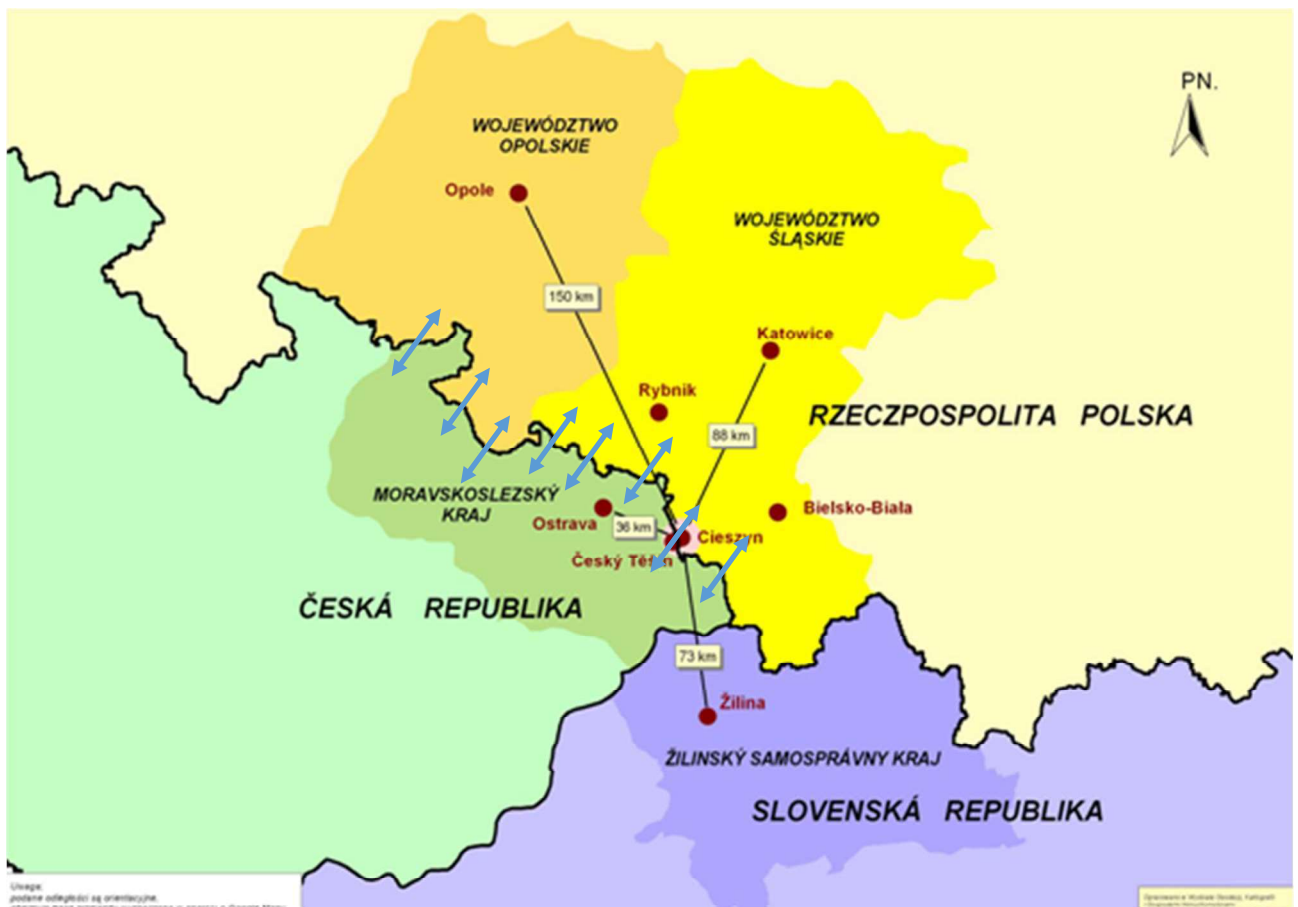
Figure 1 - Region Tritia

The presentation of budgets and main stakeholders (owners) of the projects was based on data recorded in strategic projects and a broad debate with stakeholders (at the national and regional level). The key stakeholders include: