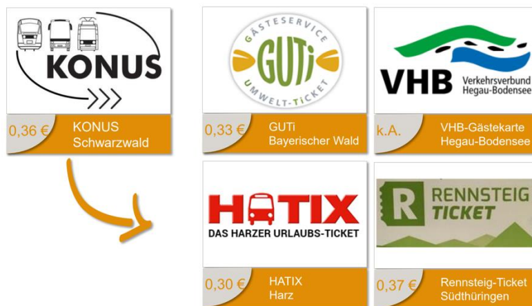
Figure 3: Overview of Public Transport Guest Cards

among the overnight guests. In addition, the proportion of journeys in inland, source and destination traffic is of importance. This gives rise to the possible development of demand. Financing could be based on the KONUS system in the Black Forest. In the Black Forest, the ticket is financed by means of a contribution financing via the visitor's tax according to the solidarity principle. In general, there are supply-side and demand-side financing possibilities. The following figure provides an orientation on the contribution amounts that are retained daily for public transport use.