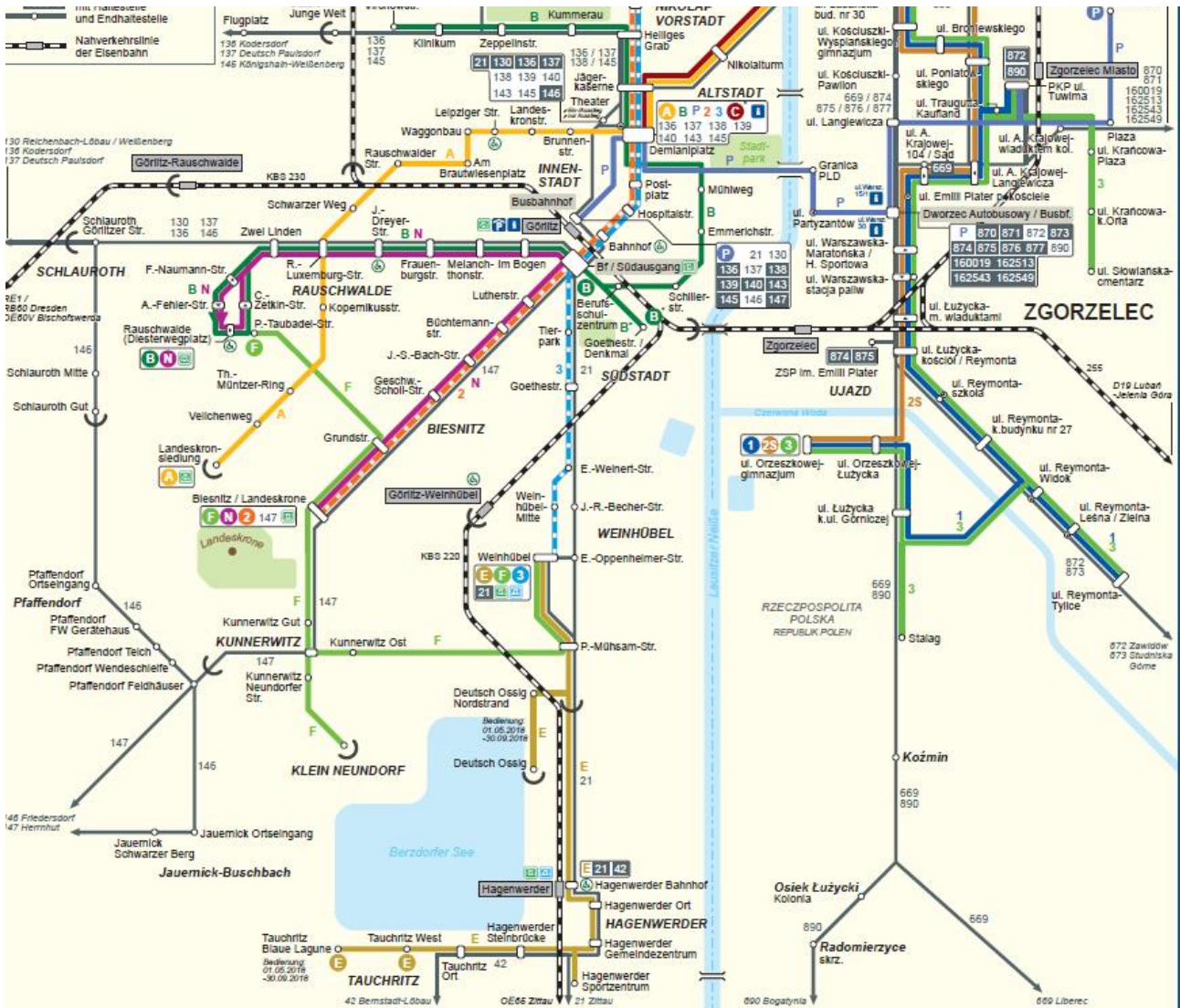
Figure 4: overview cross-border bus connections Görlitz / Zgorzelec