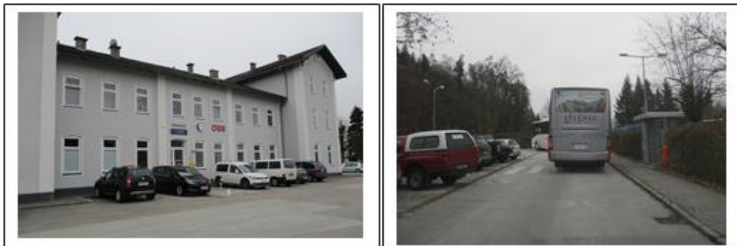
Photo 1: Link between train and bus (line 5428) at Bleiburg Bhf., forecourt. [fosimo] Photo 2: Bus stop Mahle plant, Entrance 1. [fosimo]

Based on the strengths and weaknesses identified in the current timetable, the draft timetable presented below was created for cross-border rail services between Bleiburg and Maribor in both directions. Input parameters that need to be considered are especially the starting (and end) times of the shifts at 6:00, 14:00 and 22:00. Bleiburg Bhf. (train station) continues to be the station of arrival and departure from/to Slovenia. In addition, the current timetables of bus line 5428 - as a shuttle from/to Bleiburg train station to/from the plant's premises - need to be considered. The time required to change from train to bus and vice versa is assumed to be 5 minutes.