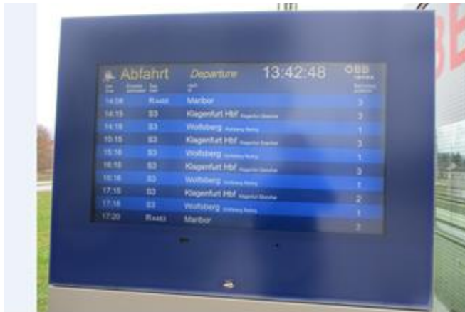
Photo 3: Departures timetable at Bleiburg train station - municipal trains to Wolfsberg depart from platform 1, whereas trains to Klagenfurt use platform 3, but also platform 2. [fosimo]

For the sake of completeness, the duration of the stops and thus the altered occupancy of platform 3 at Bleiburg train station are represented graphically in the figure below.