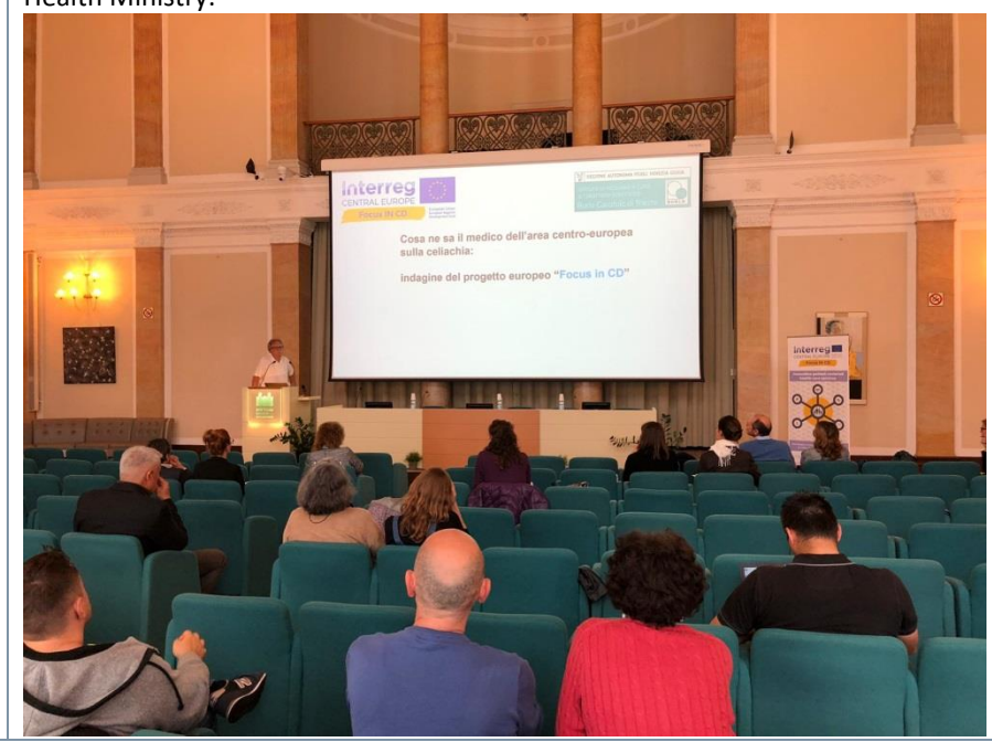
Photo 1, 2. Meeting between the heads of the food safety department of the Friuli Venezia-Giulia Region Health system, food safety technicians and nutritionists together with representatives of public catering associations and the Food Safety Director of the Italian Health Ministry.

Annexes (photo, media coverage web-links, etc.)