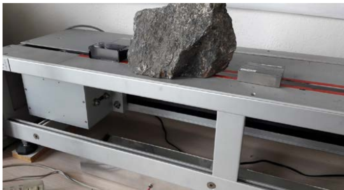
Fig. 1 View of a part of the apparatus for measuring thermal properties with the attached rock sample