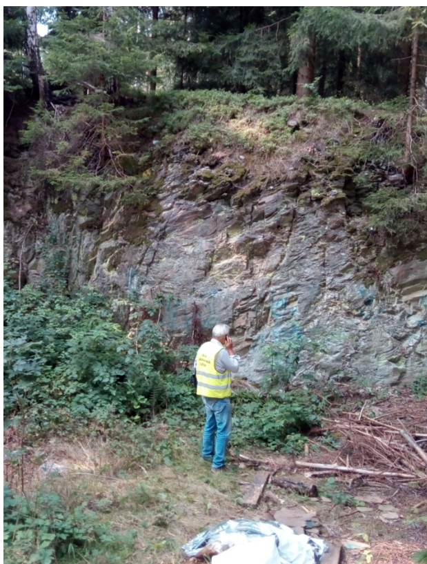
Fig. 3 Sampling of phyllite in an abandoned quarry at Czech - German border near Aš