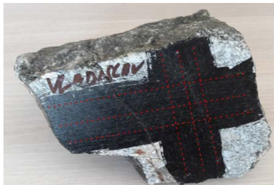
Fig. 2 Rock sample prepared for measurement of thermal properties, with indication of measurement trajectories (red lines)