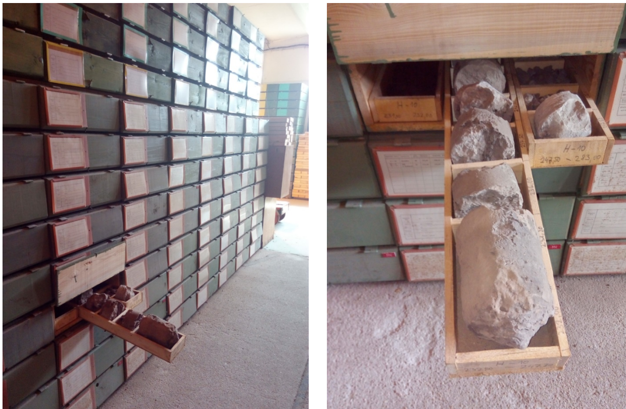
Fig. 5 Sampling of sediments from the Cheb Basin in a drill core archive of the Czech Geological Survey.