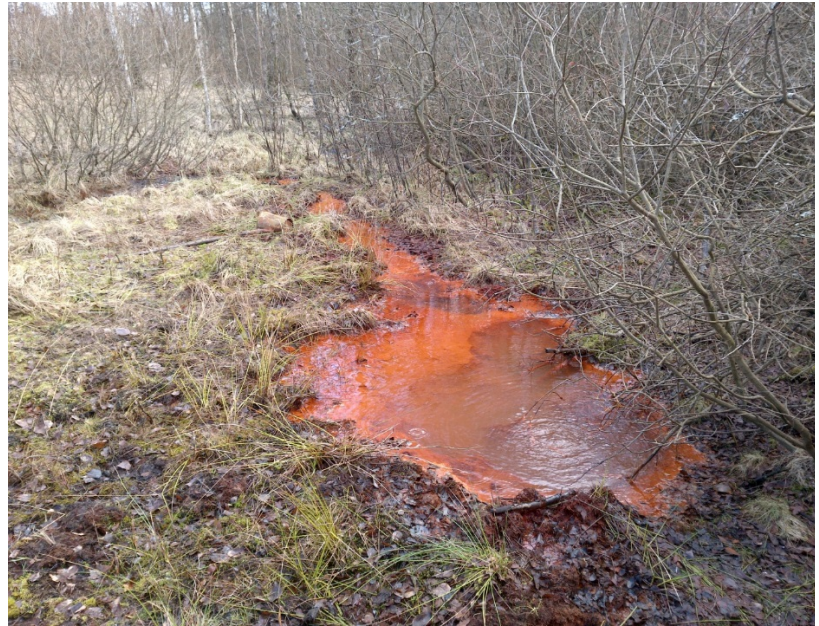
Fig. 6 Examples of photos of overflowing well and natural spring of mineral water precipitating Fe oxides and hydroxides coupled with CO 2 release.