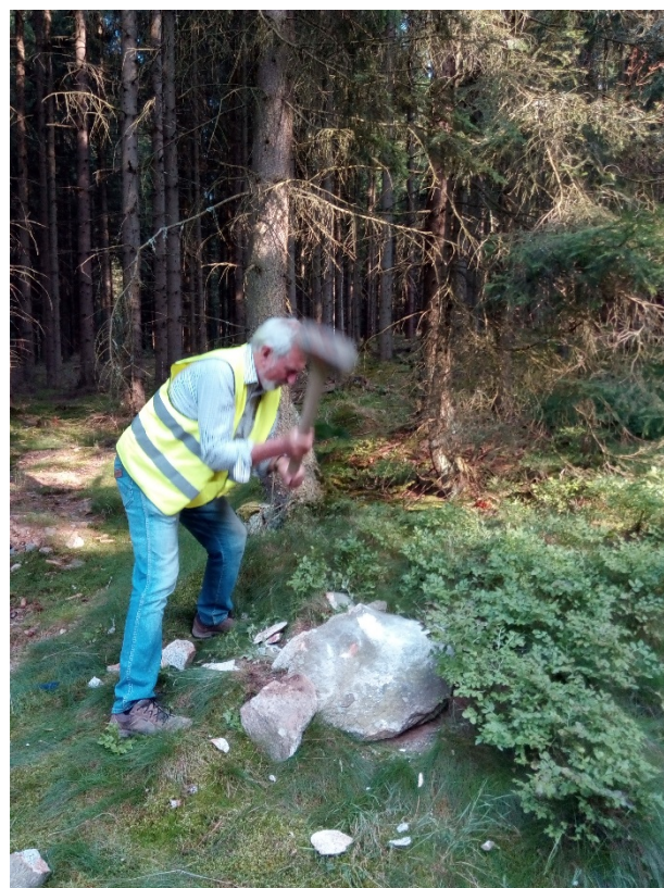
Fig. 4 Sampling of an orthogneiss from loose blocks where no fresh rock on outcrop was available.