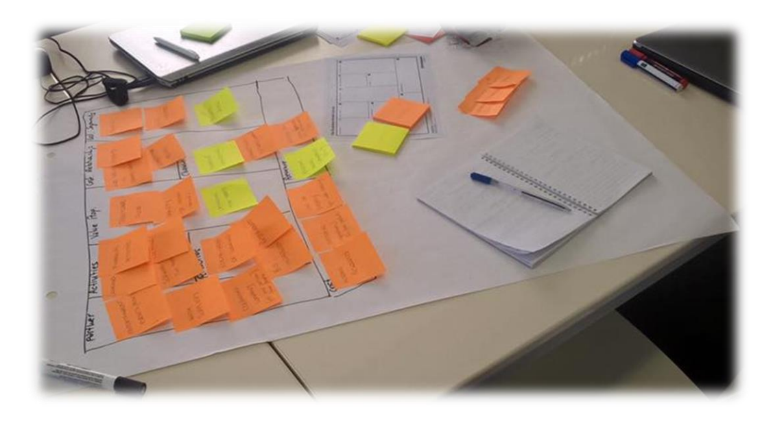
Consortium Training Course Session