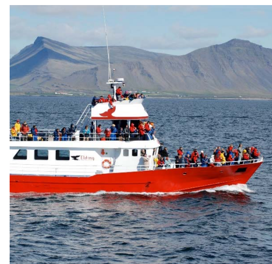
Boating Tourism Operators