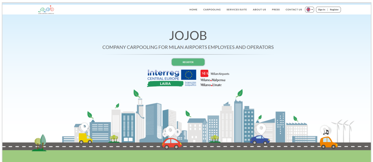
Figure 1. Jojob website landing page for Milan Airports in the LAirA project