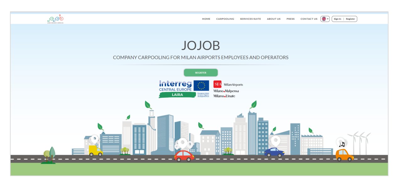
Figure 1. Jojob website landing page for Milan Airports in the LAirA project