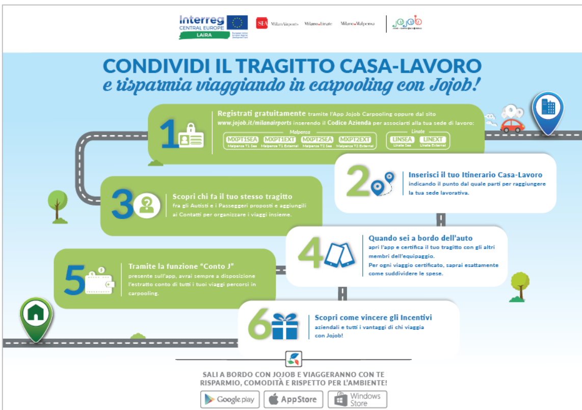
Figure 2. Communication material distributed to employees