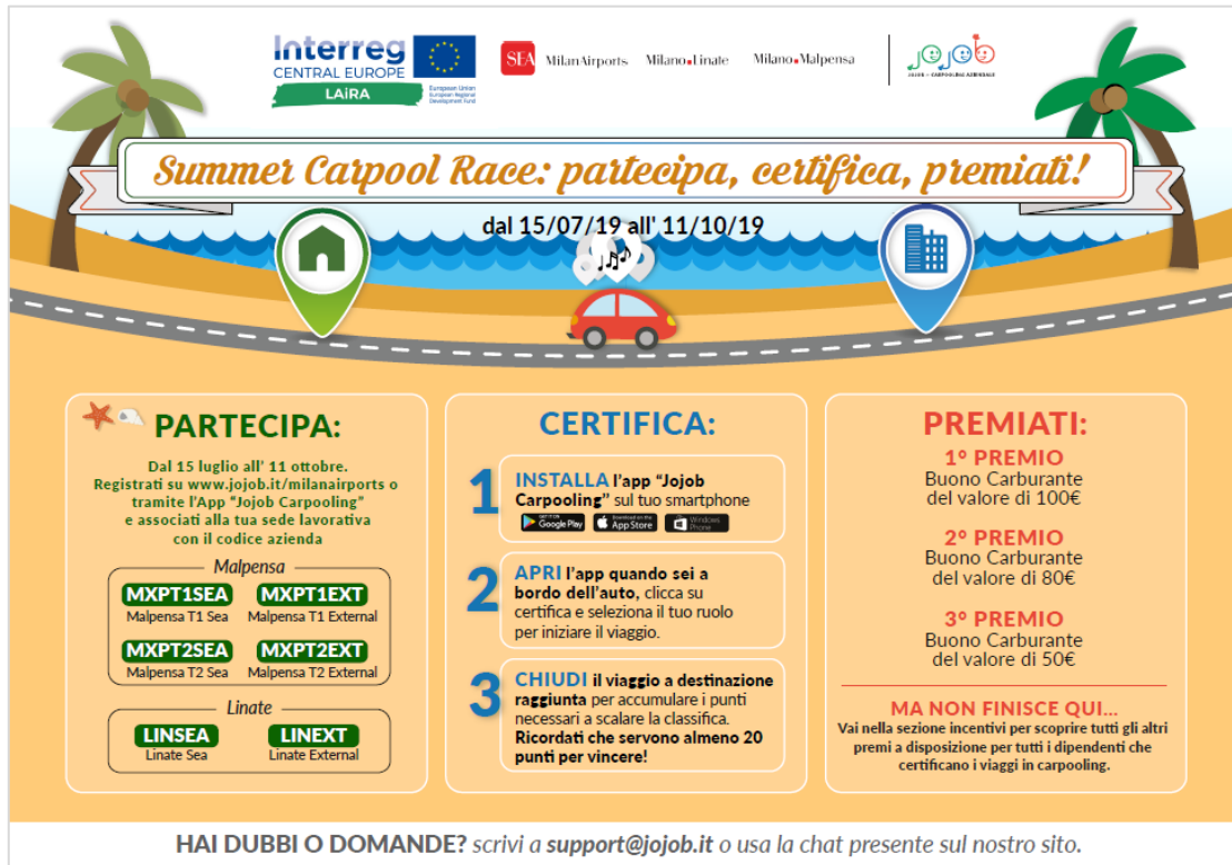
Figure 3. Leaflet on Summer Carpool Race founded by SEA Milan Airports