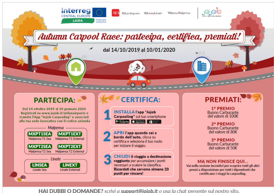
Figure 4. Leaflet on Autumn Carpool Race founded by SEA Milan Airports