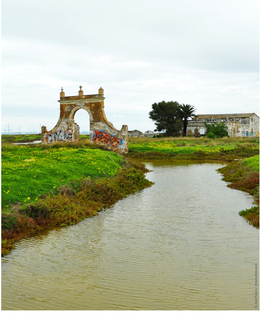
Marshes, Natural Park of the Bay of Cádiz, Spain

In the active artisanal saltpans, the average carbon stock has been estimated to be 47% of that in the natural saltmarsh. Abandoned saltpans reconnected to the tidal regime since 1985, partially recovered their organic carbon stock. Today, their carbon stock in the top 1m is 68% of that found in a natural saltmarsh in 2016. This suggests that the average carbon sequestration has recovered, and at an average rate of 3 \pm 2 \text{ t CO}_2 \text{ ha}^{-1} \text{ yr}^{-1} is now triple that of the average carbon flux in the natural saltmarsh [Ref 08].