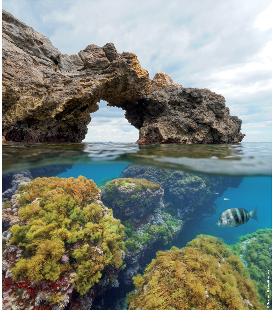
Cabo de Palos, Spain

MPAs will be affected by storm duration, intensity and direction. Extreme storms may induce significant direct (e.g. flooding, coastal erosion , damage to properties) and indirect (e.g. salt intrusion, land subsidence, vegetation destruction) impacts to the coastal zone but also in the marine realm. Shallow sublittoral communities will be affected by abrasion and damage can affect deeper habitats and community diversity. Severe storms have been shown to affect also coralligenous outcrops [ref.12], posing threats to their resilience.