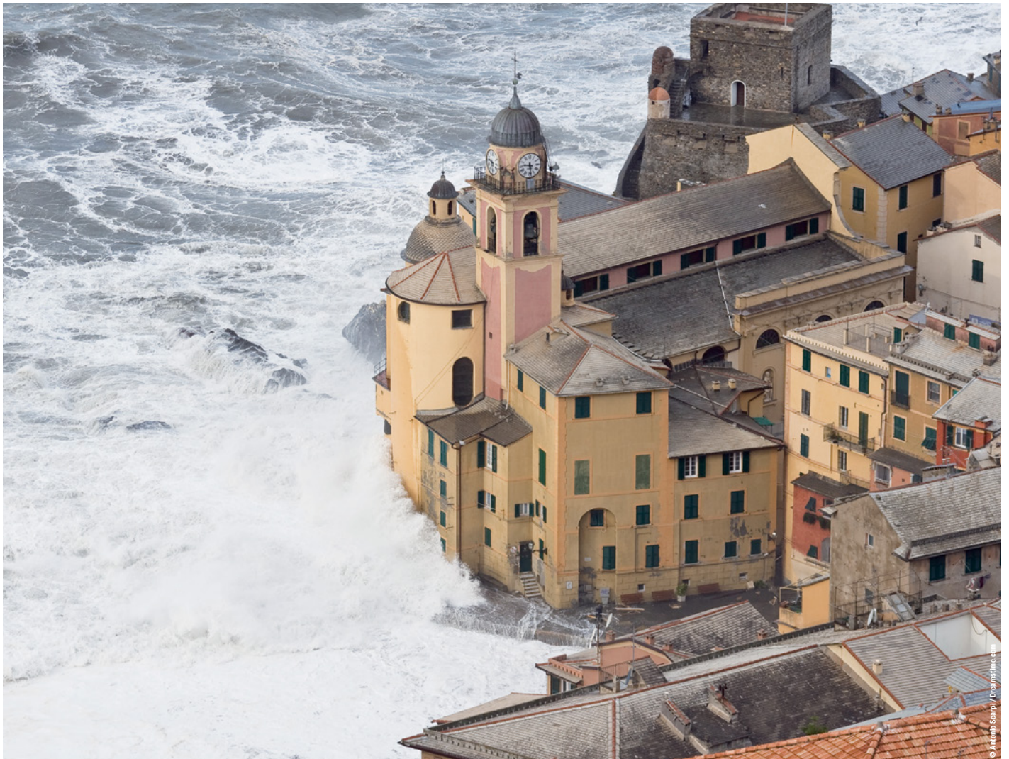
Impacts of a sea storm in Camogli, Italy (2018)

While they will be fewer ordinary to moderate storm events, it is likely the increase of frequency of violent cases with winds over 60-90 kt ( 1\text{kt} = 0,51\text{m s}^{-1} ) -Mediterranean hurricanes or medicanes- over the whole Mediterranean Sea as the century progress. This risk is largest over the western Mediterranean basin with a maximum probability that they occur around in October [ref.10].