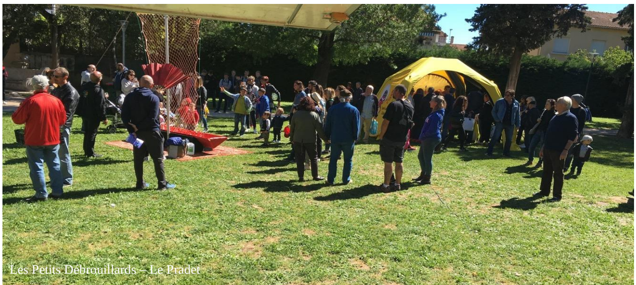
Les Petits Débrouillards – Le Pradet

Around a hundred participants stopped by the Science Tour stands. They were met by three people running an activity stand and a communication stand. The latter presented games and experiments for children and parents, like the experiment on ocean acidification and the greenhouse effect. Children enjoyed taking part in hands-on fun with the experiments. The parents also asked a lot of questions. The communication stand provided an opportunity for everyone to discuss the effects of climate change. The Port-Cros National Park territory was also presented. Finally, many kindly volunteered to fill out a questionnaire on their feelings about climate change and the “Science Tour” Event.