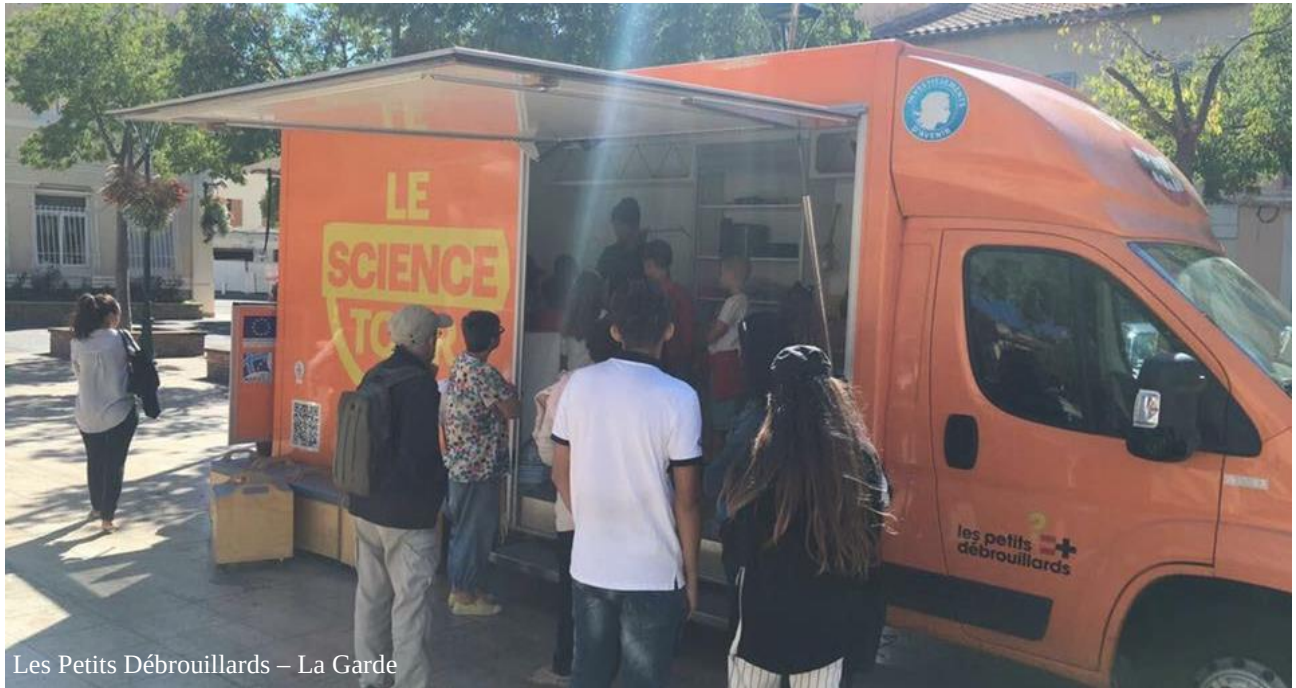
Les Petits Débrouillards – La Garde

Around a hundred participants stopped by the Science Tour stands. They were met by three people running an activity stand and a communication stand. The latter presented games and experiments for children and parents, like the experiment on ocean acidification and the greenhouse effect. Children enjoyed taking part in hands-on fun with the experiments. The parents also asked a lot of questions. The communication stand provided an opportunity for everyone to discuss the effects of climate change. The Port-Cros National Park territory was also presented. Finally, many kindly volunteered to fill out a questionnaire on their feelings about climate change and the “Science Tour” Event.