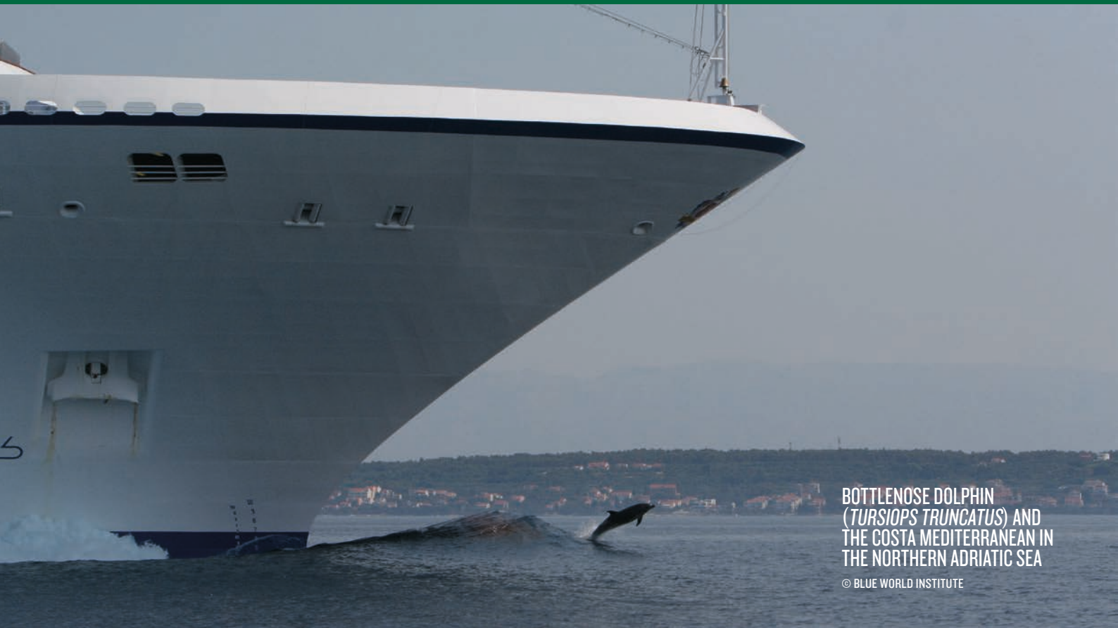
BOTTLENOSE DOLPHIN ( TURSIOPS TRUNCATUS ) AND THE COSTA MEDITERRANEAN IN THE NORTHERN ADRIATIC SEA