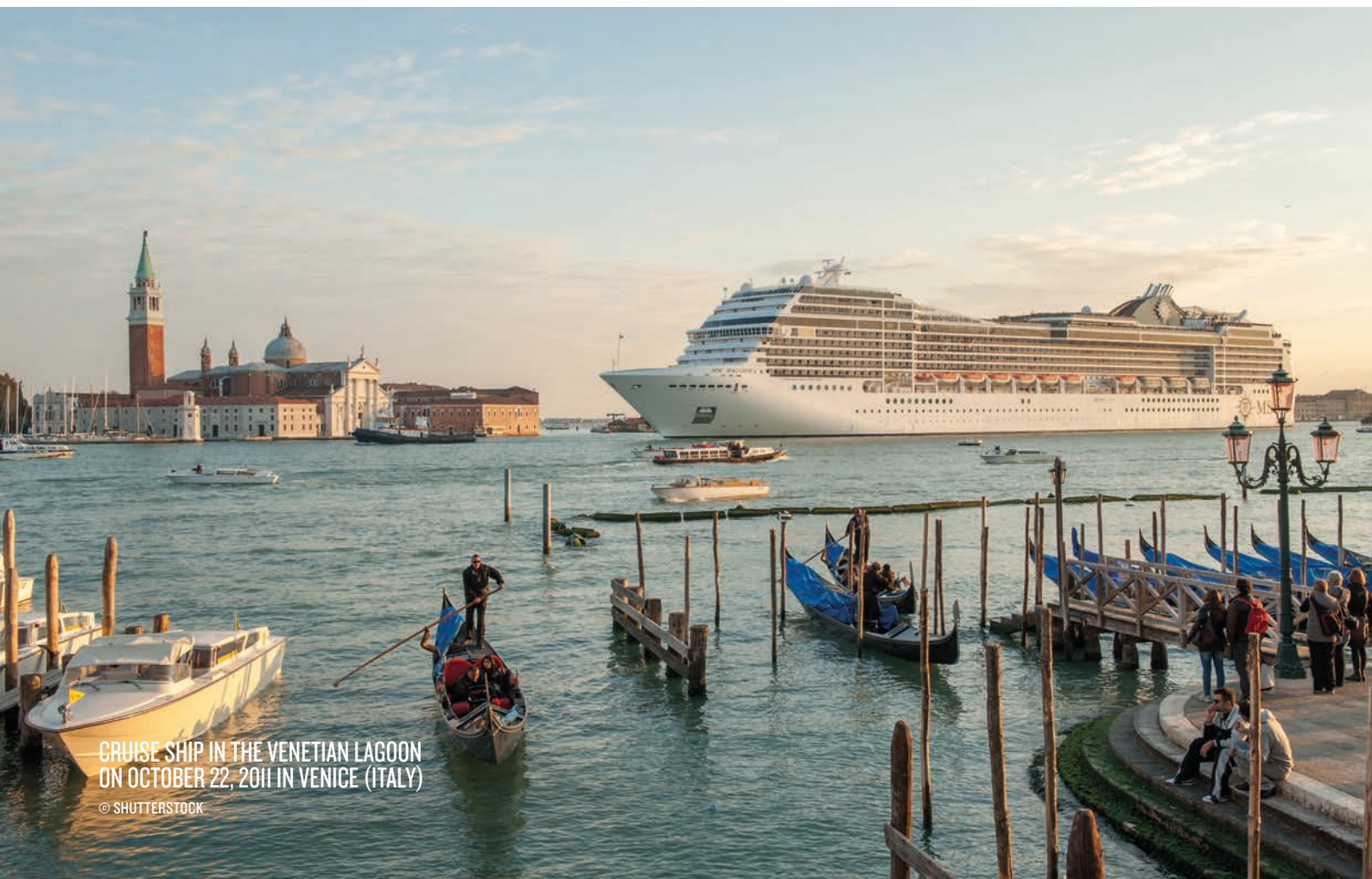
CRUISE SHIP IN THE VENETIAN LAGOON ON OCTOBER 22, 2011 IN VENICE (ITALY)