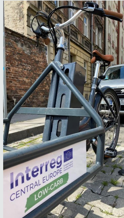
Pictures of implementation of traffic re-arrangement for the hub at Ogrodowa Street