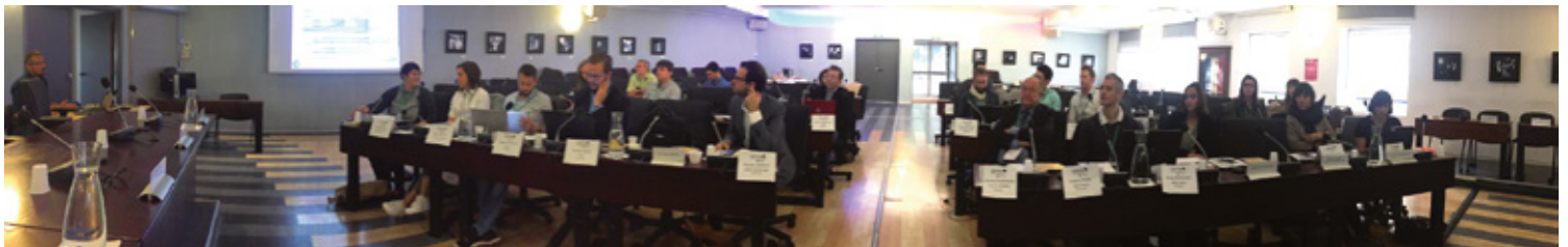
3rd project meeting of IMPULSE in Cannes (FR)