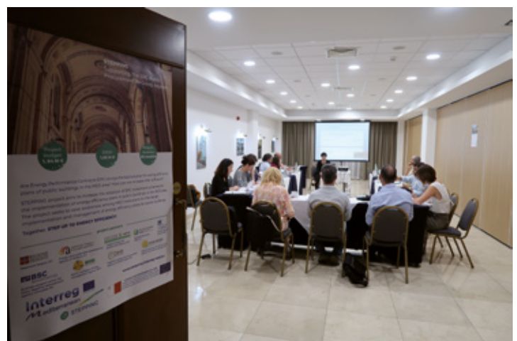
One of STEPPING's meetings

Thus far, the STEPPING project has developed three main documents. First of all, the EPC Best Practices Collection : a critical review of the best practices used in MED area in implementing EPC for buildings, baseline for elaboration of pilot's methodologies. Secondly, the Pilot Implementation Handbook , which is the strategic document targeted to partners and containing specifications for realization of pilot activities using the same methodology and approach. Finally the Concept for Investment Plan , which collects general advices to define an investment plan that guarantees the achievement of previously determined financial targets as well as the periods, costs and resources needed to make the investments feasible.