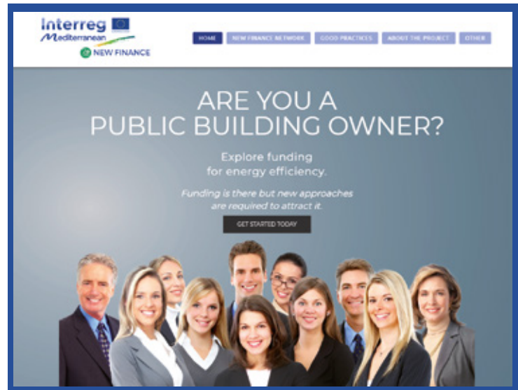
The Homepage of NEW FINANCE's e-platform

SISMA aims at finding innovative financing solutions for deep renovation of public buildings: as a first step it was necessary to better understand who in Europe already deals with Energy Performance Contracts (EPCs) and how they are applied . An analysis of the information on existing financing schemes combined with a survey embracing 24 European projects addressing the topic of EPCs was carried out to single out best practices for EEB. Moreover, consultations with local stakeholders (i.e. ESCOs, investors and insurance companies) were carried out based on a common questionnaire format, in order to retrieve relevant and context-specific data, namely empirical data on IRR, financing structure of ESCOs and average investment size of projects. Results of data analysis and of consultations will be processed for developing the SISMA innovative financial models targeting each different end-use of public buildings taken into consideration within the Project and promote their energy refurbishment.