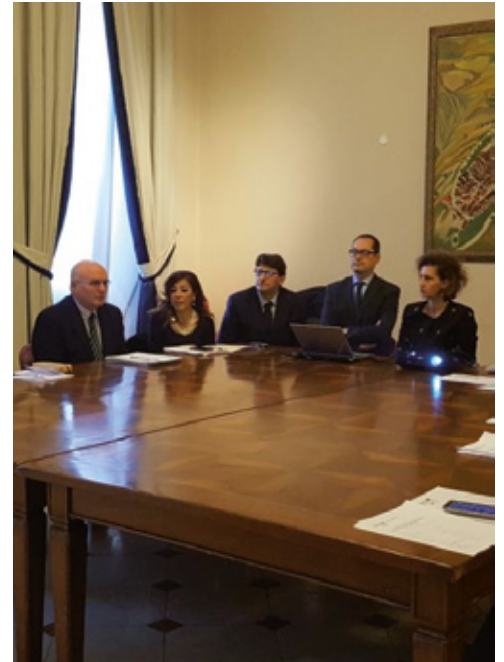
PrioritEE: First Local Living Lab in Potenza (IT)

PrioritEE project has organized the first series of workshops in the participating countries: in Italy (Potenza, 20th of July 2017), Portugal (Santarem, 28th of June 2017), Spain (Aragon, 6th of July 2017) Croatia (Karlovac, 4th of May 2017) and Greece (Kozani, 23rd of June 2017). The main aim of these workshops was to establish the status quo in the five pilots as well as to collect the requirements of local authorities on EE as a necessary step to design an ad-hoc project toolbox. The experience gathered in the local workshops and the suggestions put forward by the local public authorities will be compiled and shared with the professional institutions involved. After evaluating these contributions, these will be included into the common training material and training courses , which will be refined to incorporate the new improvements. In total, more than 100 representatives from local authorities', local enterprises for energy, energy centers, universities, chambers of commerce, etc. have participated to this first round of events. Between December 2017 and January 2018, five Local Living Labs are being organized in the pilot cities to boost the effectiveness of local energy policies and measures on EE and RES in Municipal Buildings, in order to increase energy awareness and promote behavioural changes in citizens and to inform local communities.