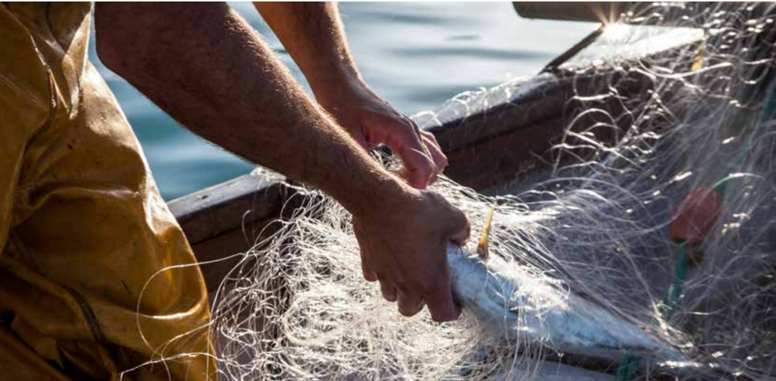
Cap Roux, France.