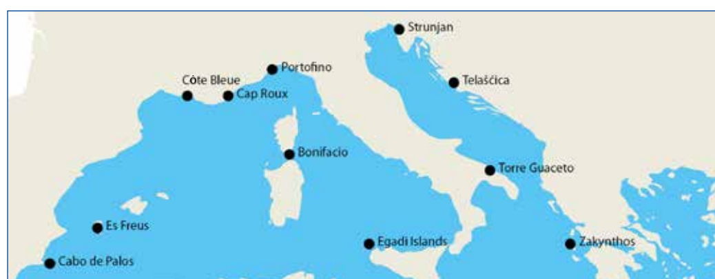
The 11 Pilot MPAs in 6 Mediterranean countries: Spain, France, Italy, Slovenia, Croatia and Greece