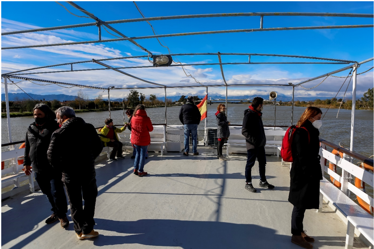
Field visit by boat to the Ebro Delta Natural Park