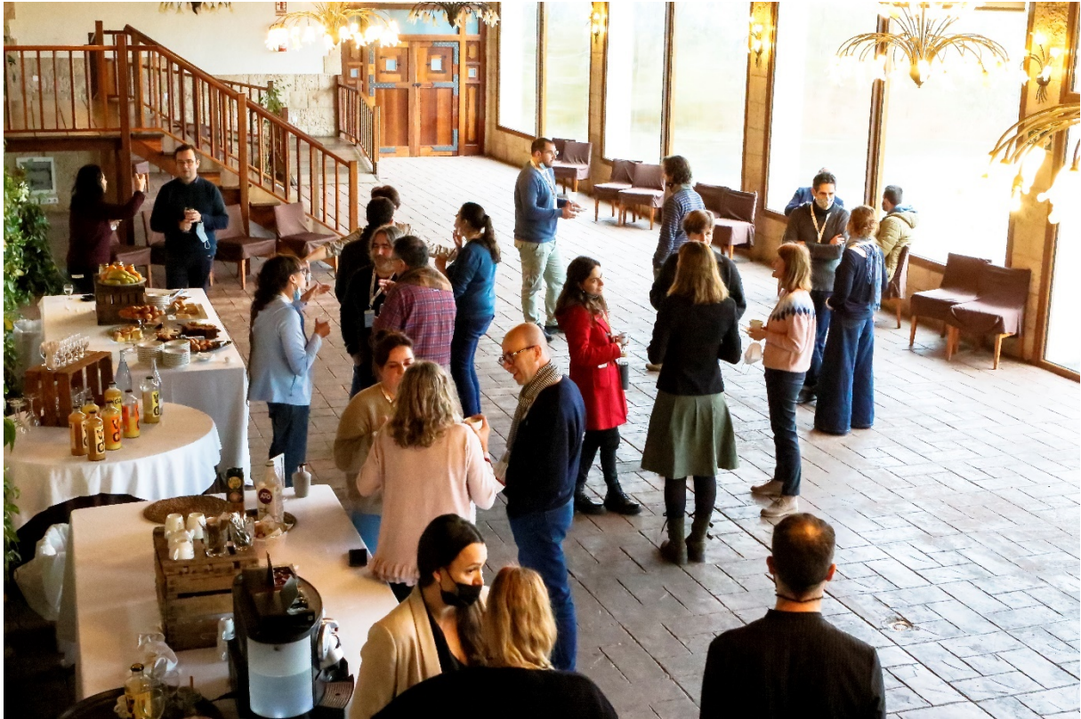
Networking during the coffee break