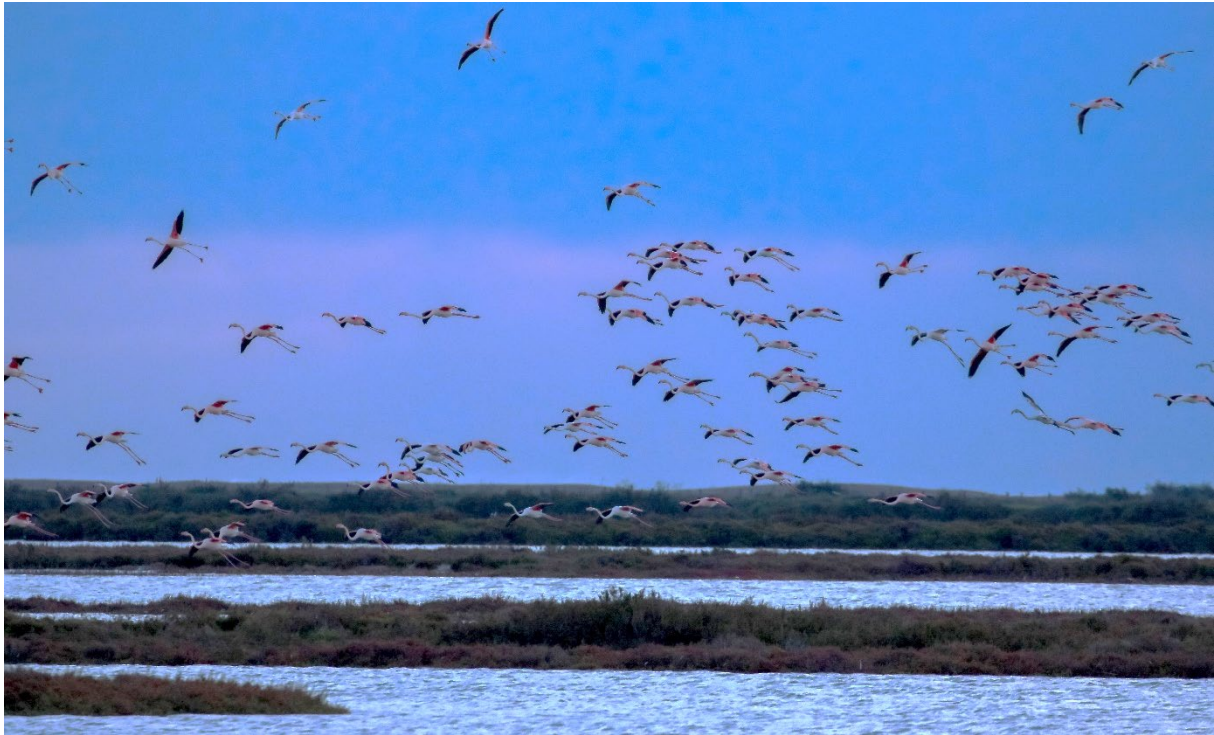
Flamingos at Ebro Delta Natural Park