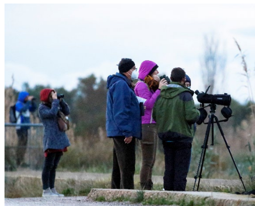
Bird-watching at Ebro Delta Natural Park