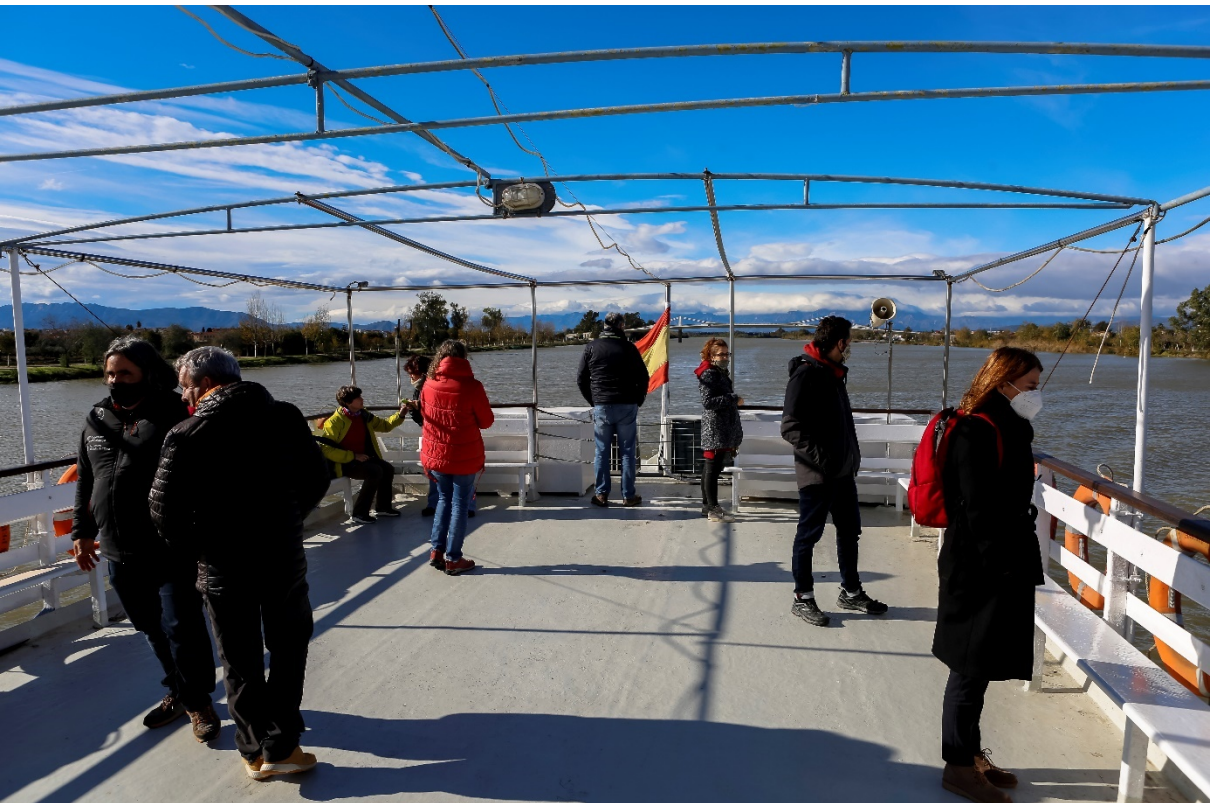
Field visit by boat to the Ebro Delta Natural Park