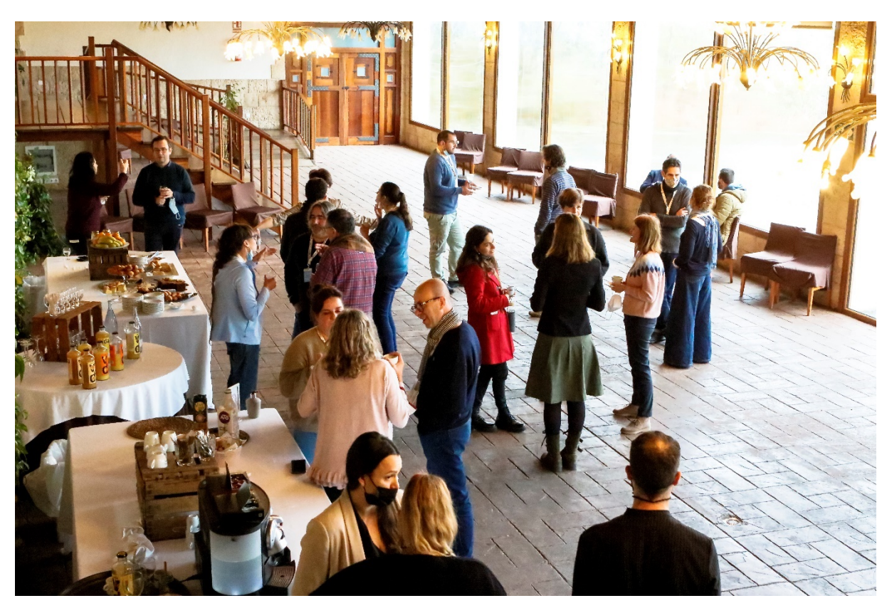
Networking during the coffee break