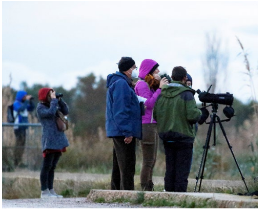
Bird-watching at Ebro Delta Natural Park