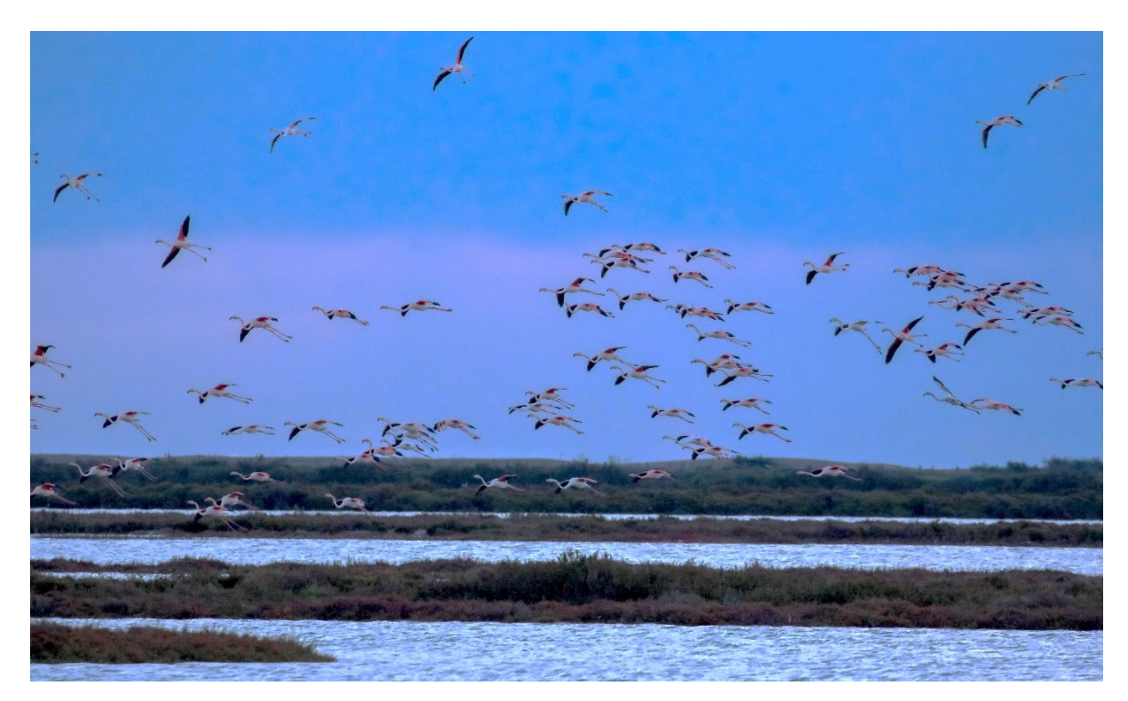
Flamingos at Ebro Delta Natural Park