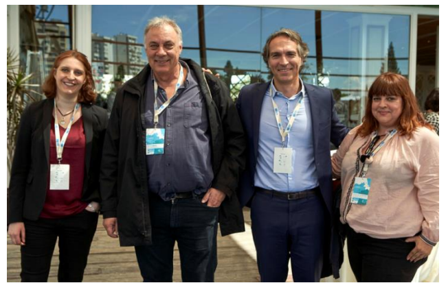
Spanish PB MPAs info day. 11.04.

The agenda of the session II (block 3), coordinated by PANACeA, is included as annex III.