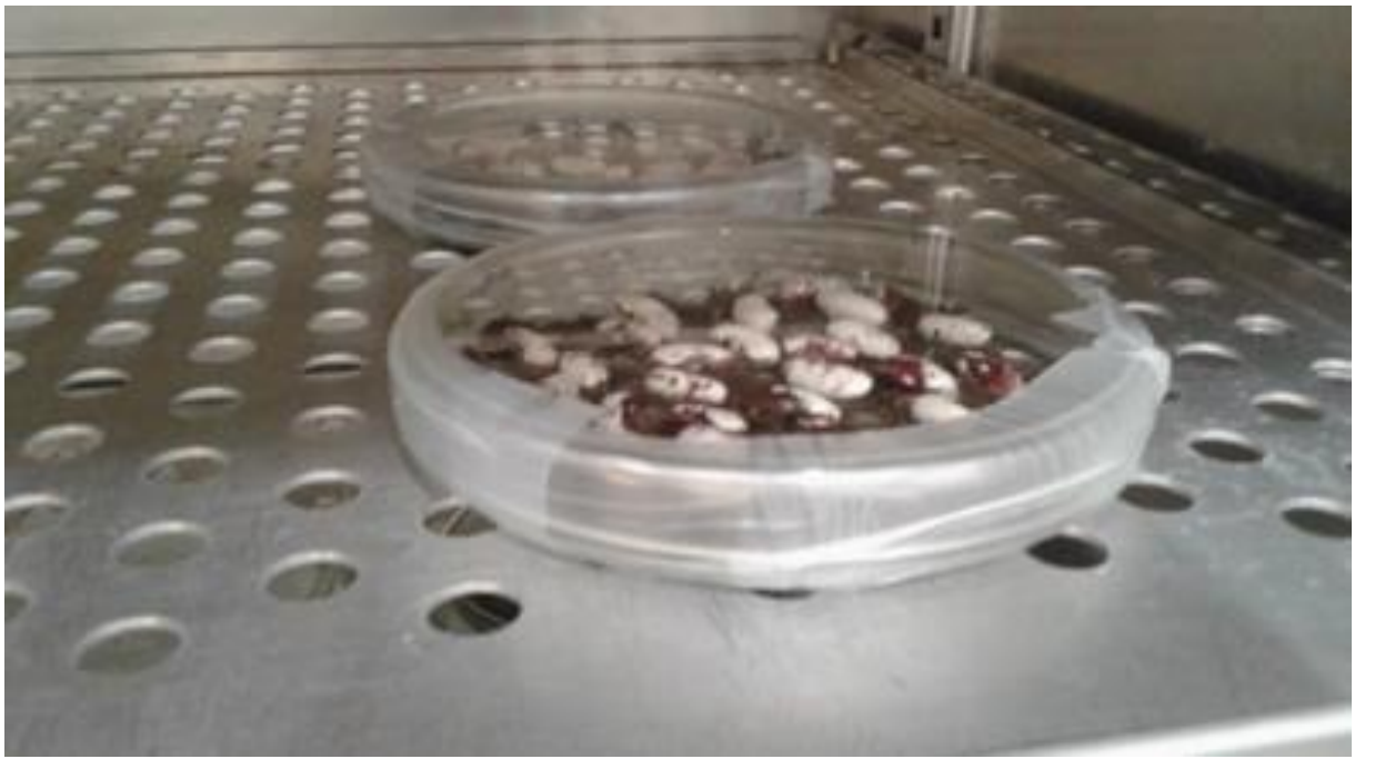
Fig. 2- Insertion of petri dishes sealed with parafilm into the incubator at light and room temperature.