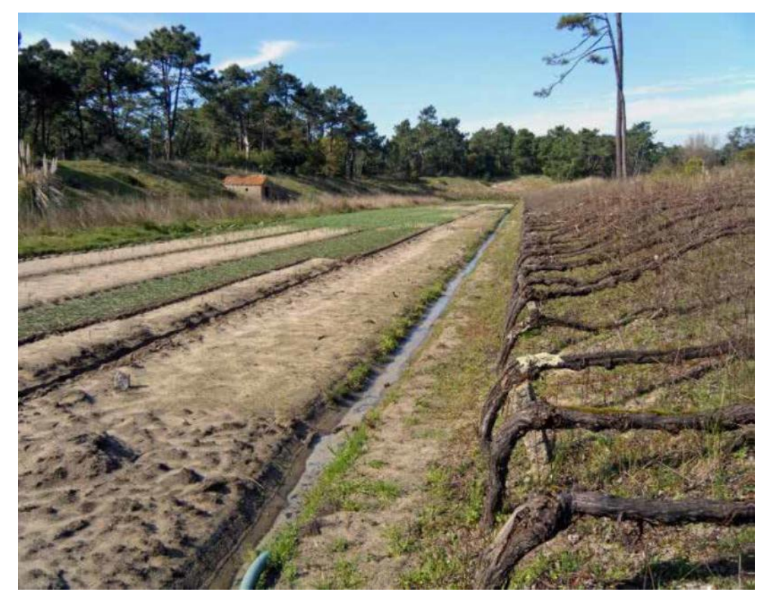
Fig. 1- "Campos de maceira"