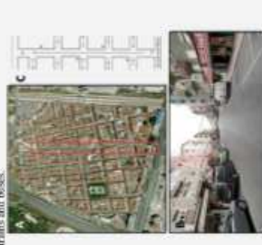
Figure 1. [A] Acrial view, [B] local view of the street canyon and [C] traffic intersections

provamance schemes that result in an operational path replicable by other MED retain areas with different city sizes, in the Portuguesc case, no achieve this goal it piles even in Lowers with 1.56 km² and 21.891 inhabitants (in 2011) was released. The piles case (Figure 1) is defined as a street empon and in a one-way two-base sixest with a total exercision of 3.2 km with 1 intersection with unified lights. The area is also Imposable low carbon mobility offutions, part of interest MED Program and co-faceled by EROF) aims in strengthening the capacity of cities to use low carbon transport systems and include them as their multity plans by testing existing mubility solutions, through an assessment tool and participatory REMEDIO project (Regenerating mixed-use MED urban communities congested by traffic through served by underground, rail trains