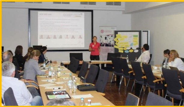
Around 20 representatives of universities from Bavaria, Austria and the Czech Republic listened with interest to the TRANS 3 Net lecture.