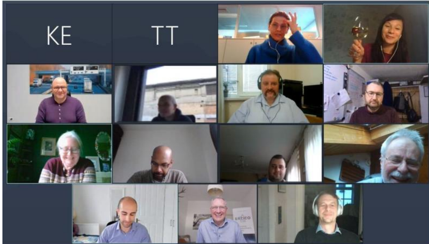
Participants from 14 different European Countries