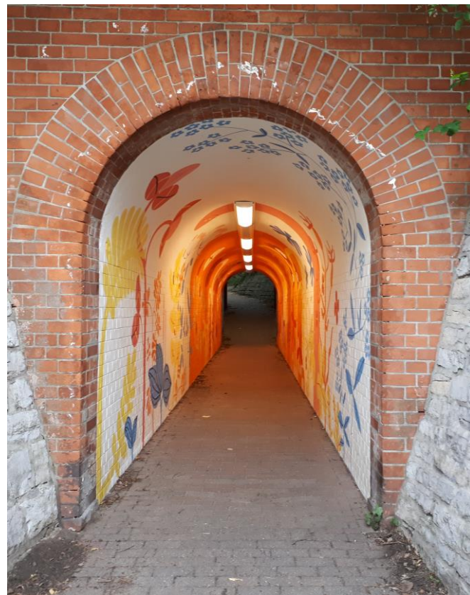
LUCIA Pilot Site: Schröders Elbschlosstunnel