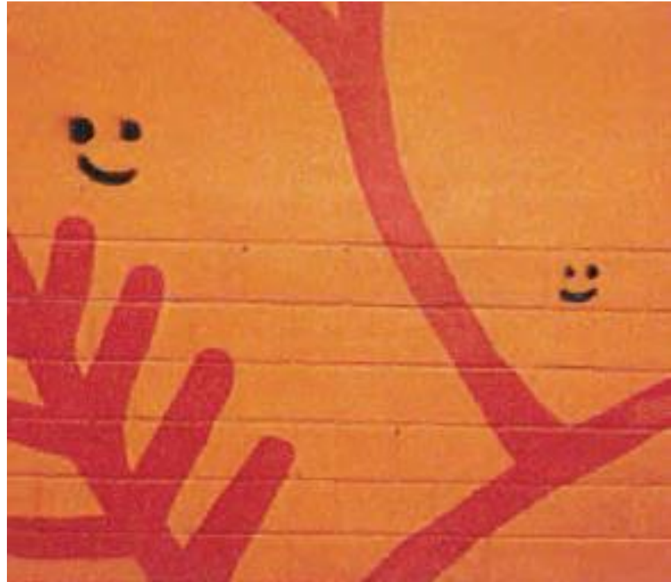
LUCIA Pilot Site: Schröders Elbschlosstunnel