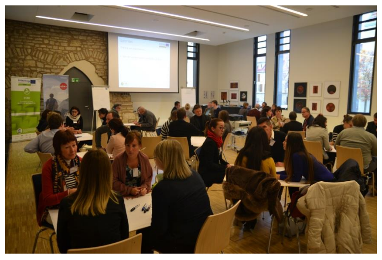
1^{st} round World Café with the trainers