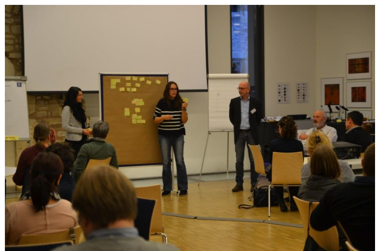
Harvesting field exploration