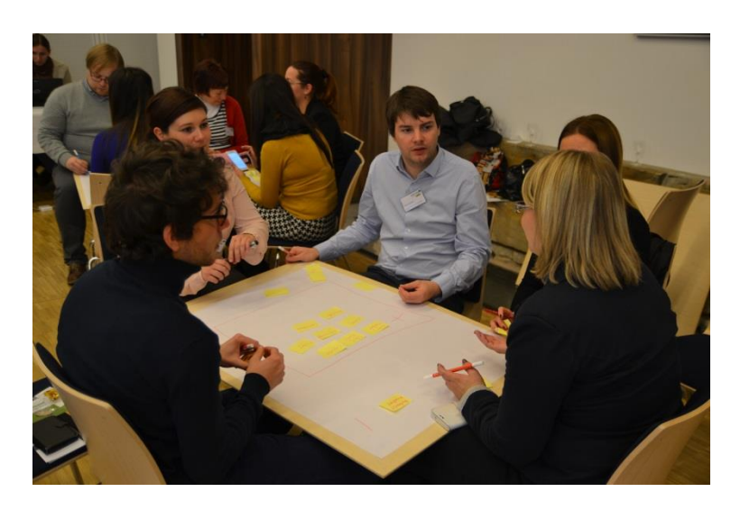
Field exploration with the trainers