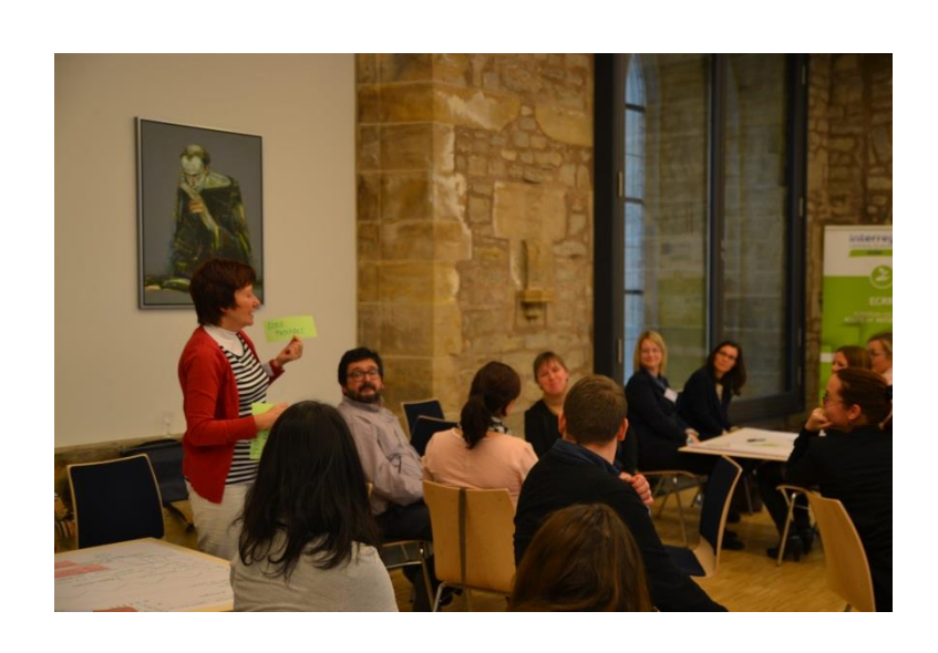
Bingo harvesting results from World Café