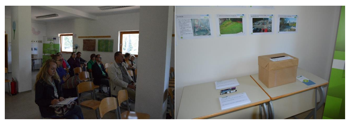
Stakeholder event at botanical gardens

f) Animation of participants for each cycle: Personal contact was established, to form a community consultative assembly and determine contact persons and responsible persons for each organization based at the MRA office building, to participate in the activates and a date for a meeting of circle 1 was selected using a doodle survey. For circle 2 (the Cultural Hub Karantena) a firm cooperation with the coordinator of organization within the hub was established, and they were the ones directly inviting their organizations to participate in activities. Also, for circle 3 cooperation with the city district MČ Magdalena was established, and they were the ones directly inviting their stakeholders and interested public to participate in activities. g) Tender for technical assistance: Two external experts were hired. First expert will provide conceptual solutions for rehabilitation of the degraded areas by providing three potential solutions based on the inputs provided at each of the circles. The second was hired to conduct a survey among users of the parking space and set up a web-site promoting the area with additionally featured online survey about the pilot area, in order to bring the users in.