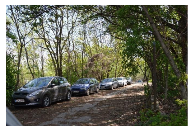
Unregulated parking within the pilot area