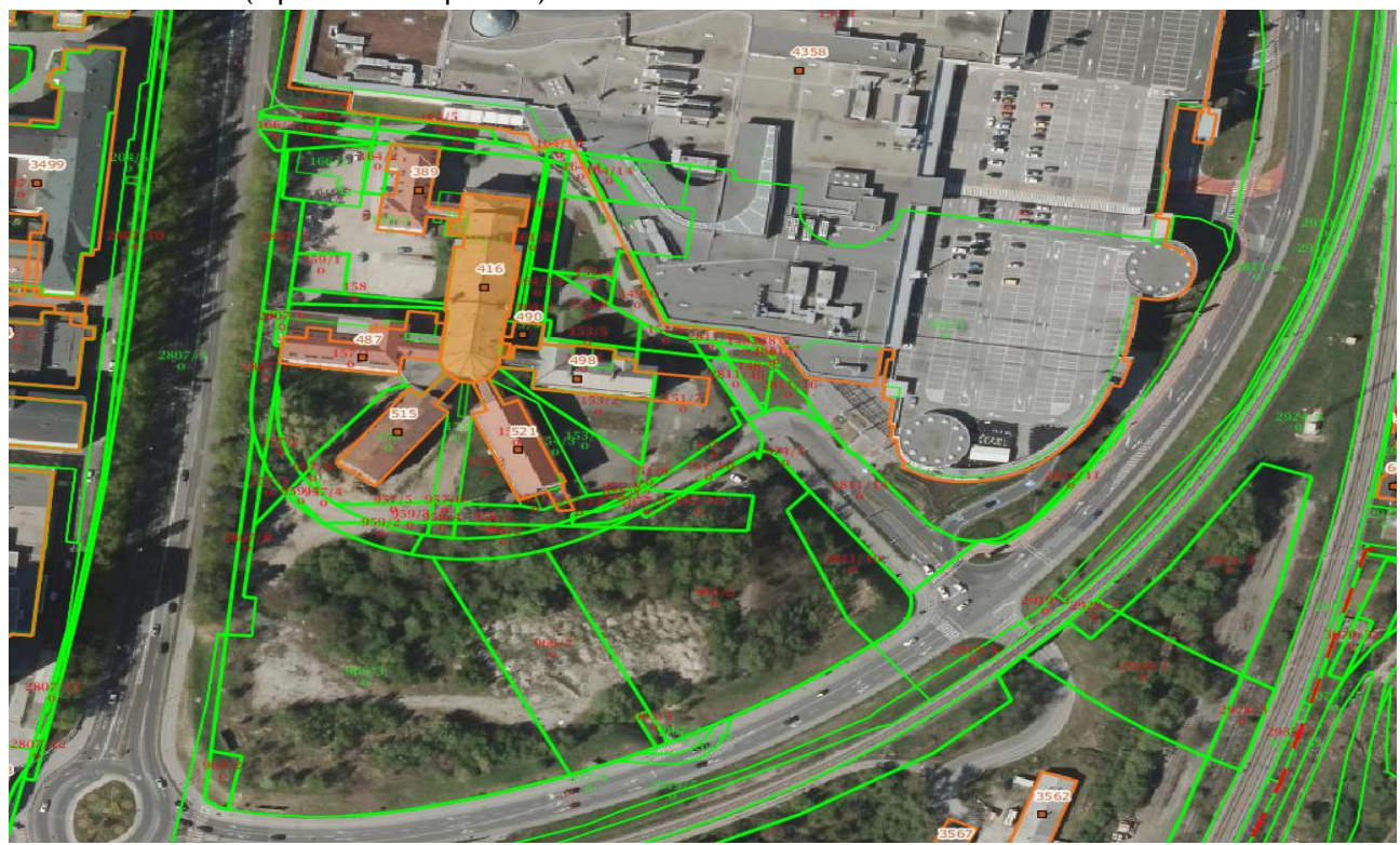
The Surveying and Mapping Authority of the Republic of Slovenia - map of ownership

a) Identification of private and public owners within the pilot areas: In order to detect and define the community the results of the meeting in October 2016 were used, additionally the staff members of the MRA UGB project team used the publicly available data (The Surveying and Mapping Authority of the Republic of Slovenia; and Ministry of Justice) in order to establish the ownership within the pilot area. There were 7 owners identified (2 public and 5 private).