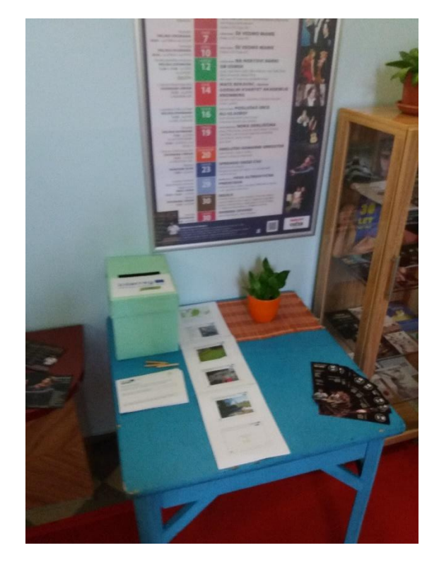
UGB suggestion box