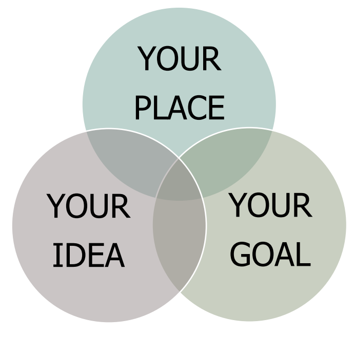
Figure 1: UGB Model Roadmap

To show Project Partners how it can be done based on example of existing projects in italic - the implementation of one of the a ideas - the idea of a social garden to achieve the goal - to revive and integrate the community and enrich the existing natural area within the city.