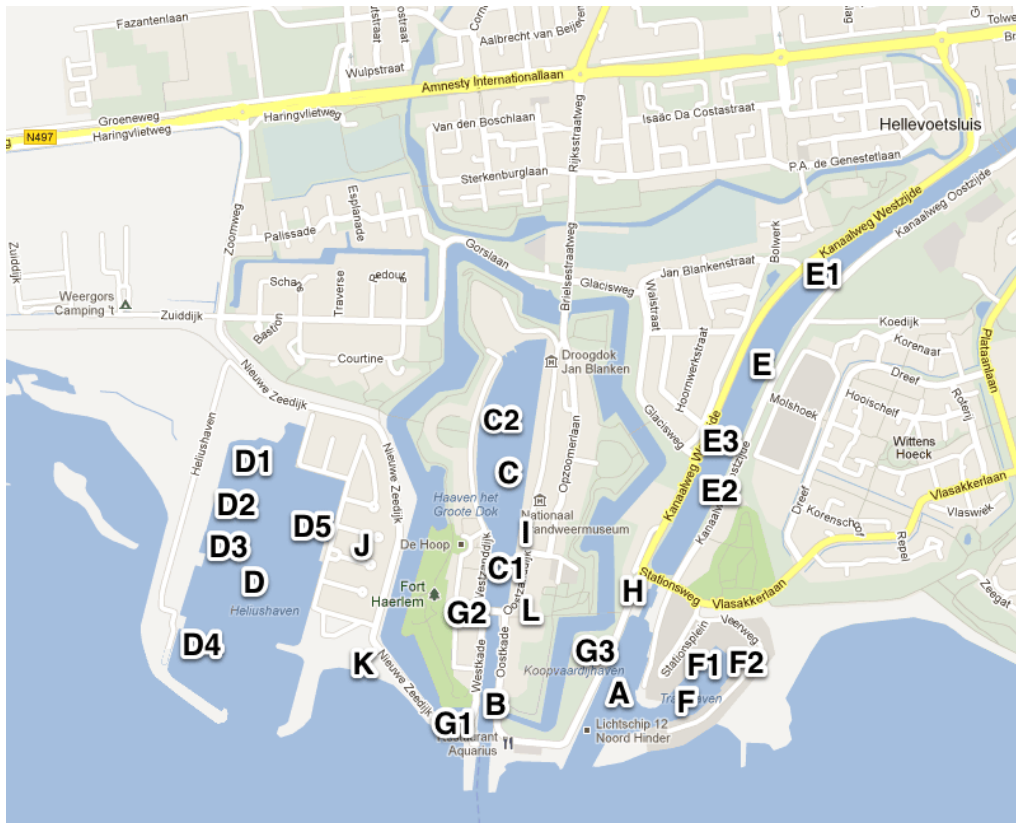
Figure 1: The port area of Hellevoetsluis

The port area of Hellevoetsluis consists of four harbours: Veerhaven, Kanaalhaven, Vestinghaven and Heliushaven. Two commercial ports and four water sports associations are active in the port area. In addition, there are water sports-related activities. Lastly, part of the port area is owned by the municipality of Hellevoetsluis. The port area can be seen in Figure 1.