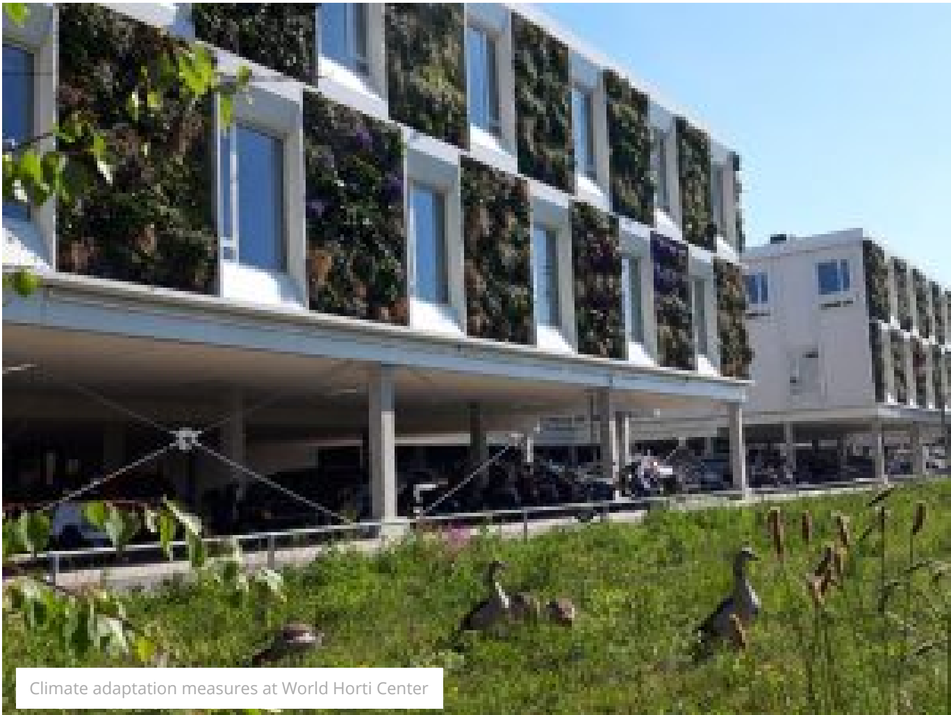
Climate adaptation measures at World Horti Center