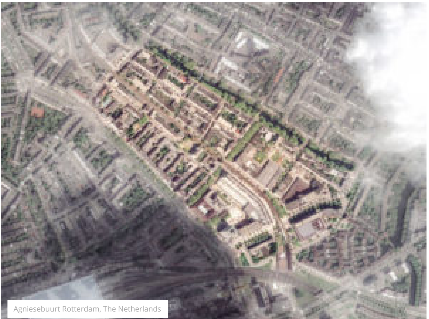
Agniesebuurt Rotterdam, The Netherlands