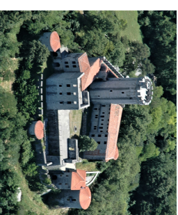
Ribemberk castle, Municipality of Nova Gorica, Slovenia - one of RESTAURA pilot actions locations.