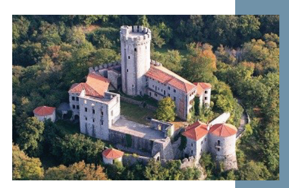
Rihemberk castle, Municipality of Nova Gorica, 2012.

During the pilot action, it was possible to establish good communication with local stakeholders, conclude the Integrated Built Heritage Revitalization Plan for Nova Gorica, discuss and propose new usage of the castle complex, and prepare the Conservation plan for the Rihemberk castle (currently under review). Additional technical, legal and financial surveys and documentation are planned to be prepared, as well as specific tools for promotion of the pilot location on PPP market.