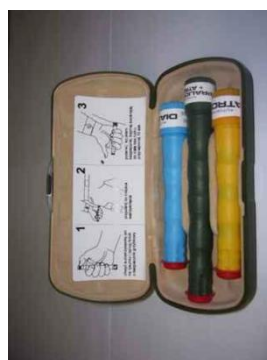
Fig. 2 Atropine injections set