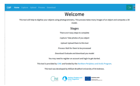
Figure 2 Start up page for CAPS

Equipment to take the photographs required for photogrammetry, is either already available or available to buy at a small cost. Expensive camera's may help by a mobile phone camera or old digital camera will do a good job. However, computers with the capability to processing photographs to create accurate models are often not available and are expensive to buy. Whilst commercial photogrammetry