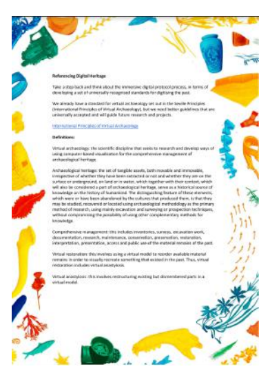
Excerpts, full documents see LP report period 6, T2.2.1