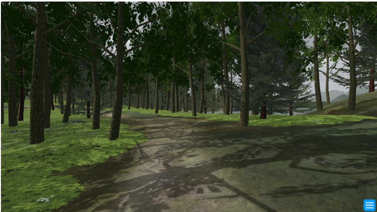
The central area of Vágar (same position as above) with 6 degrees increase in average temperature. The vegetation is dominated by oak in the parts with a rich and nutritious cultural layer, and pine beyond.