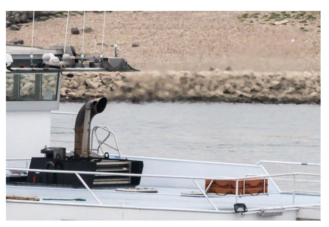
Figure 2: Pictures of exhaust plumes (left: engine reversing, right: typical appearance at steady state operation)