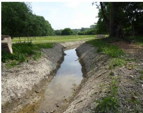
Life+ project (Danube, Slovakia)

Restoration and management of Danube floodplain habitats. Channel and its surrounding after filling up – the whole island came into life – storks came to see all the frogs.