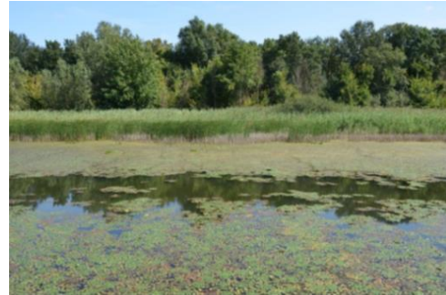
Old Drava backwater reconnection near Barcs