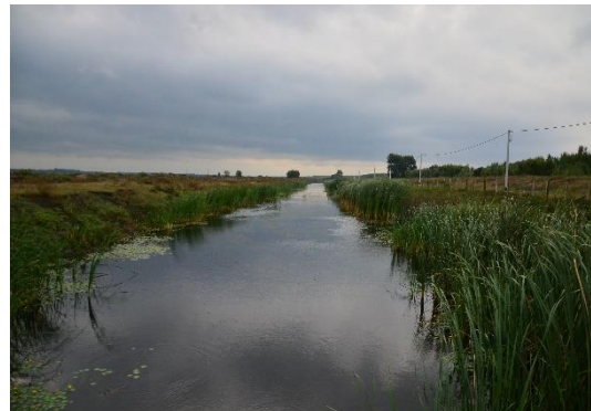
Danube Delta (Romania)

Habitat restoration by reconnecting the former Carasuhat agricultural area to the Sf. Gheorghe Branch.