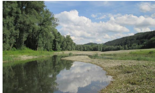
Schildauer Au (Danube, Austria)

One-sided connection of separated oxbow lakes, reconnection of the discharge regime of the Danube.