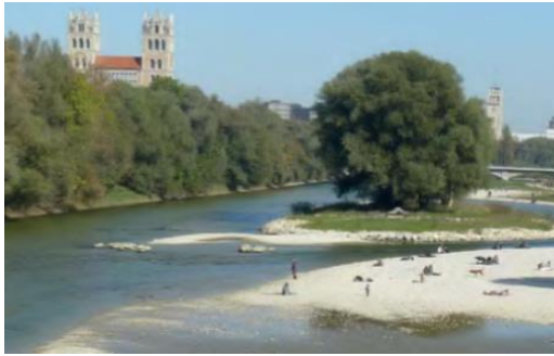
Isar Plan (Munich, Germany)

Containment of floods, more space for recreation in a more natural ecosystem.